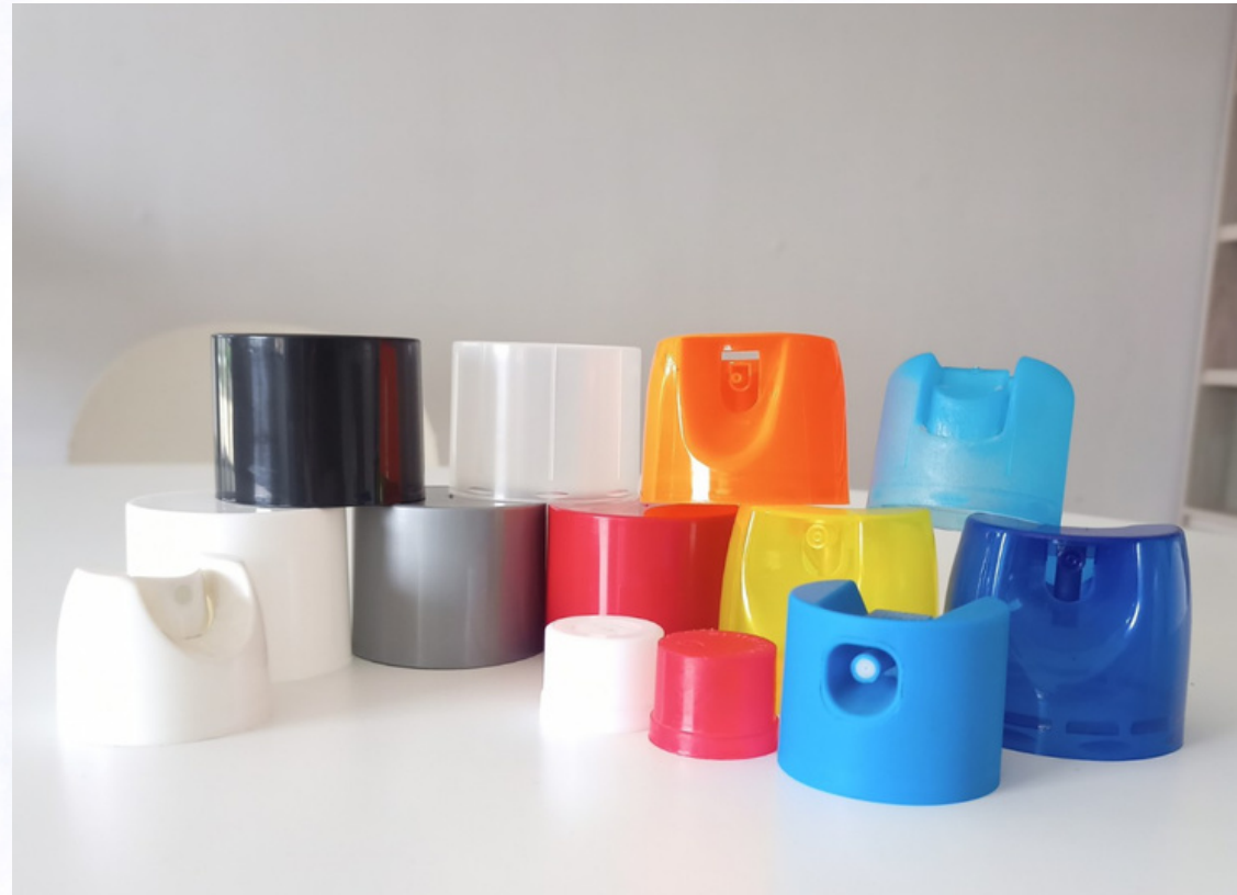
Plastic caps for aerosol tin can