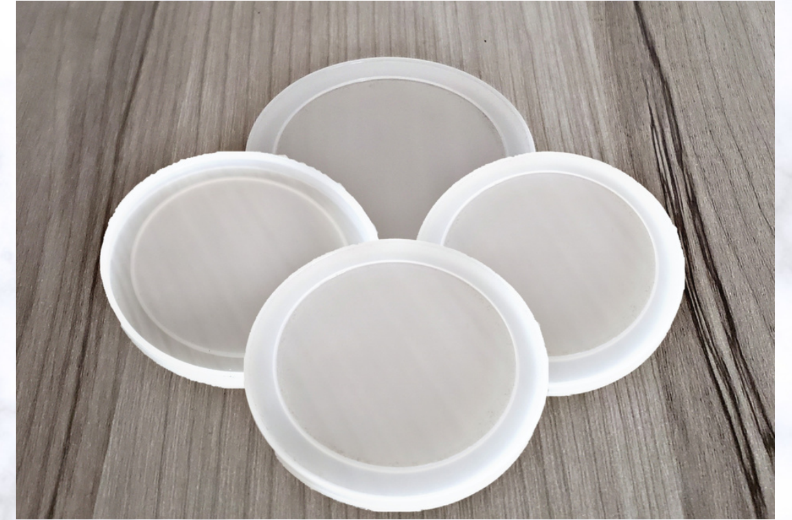
Plastic cover caps for food can