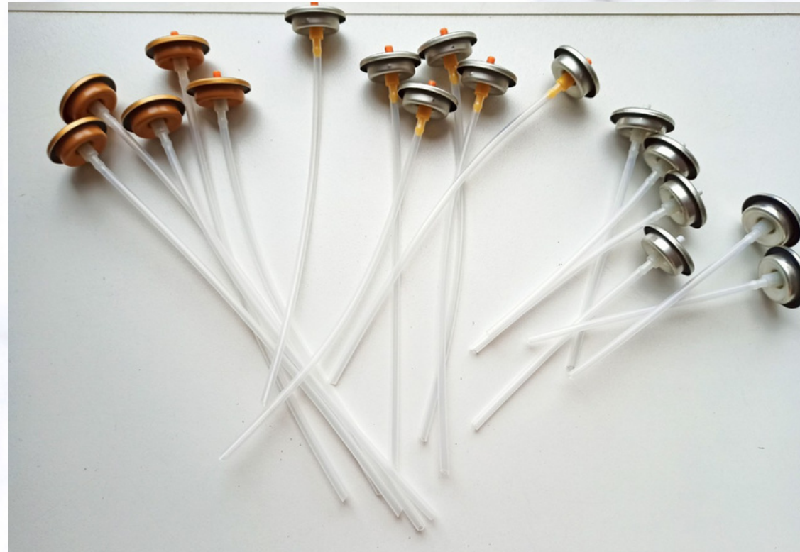
Valve and actuator for aerosol tin cans