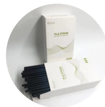
盒装 ▼ Box-packed