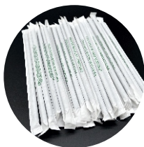
独立纸包装 ▼ Paper packaging