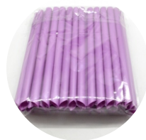
袋装 ▲ Bag package