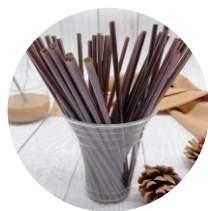
咖啡渣吸管 ▲ Coffee grounds straw