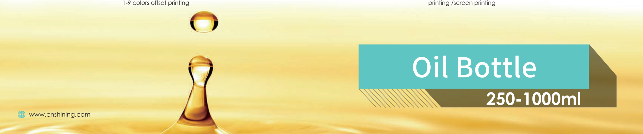
1- 8 colors heat transfer printing /screen printing