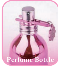
Perfume Bottle Page 7-8