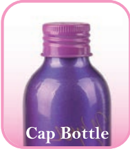
Cap Bottle Page 6