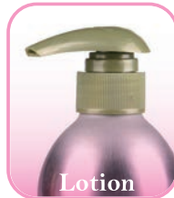
Lotion Page 3-4