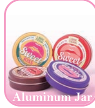
Aluminum Jar Page 13-14