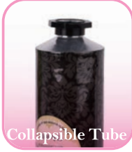
Collapsible Tube Page 11