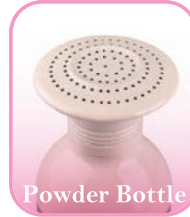
Powder Bottle Page 10