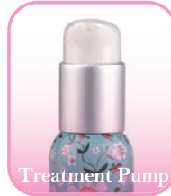
Treatment Pump Page 5