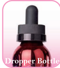
Dropper Bottle Page 9