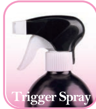
Trigger Spray Page 2