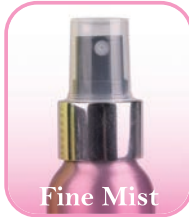
Fine Mist Page 1