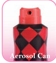
Aerosol Can Page 12