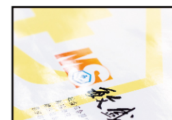
Gloss Lamination 亮膜