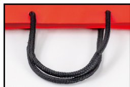
Cotton Rope 棉繩