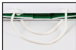
Woven Handle 紙針通繩