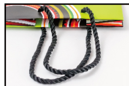
Nylon Rope 尼龍繩