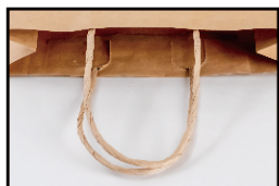
Paper Twisted 紙紐繩