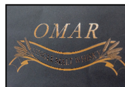
Spot UV 局部光