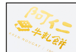
Gold Hot Foil 燙金