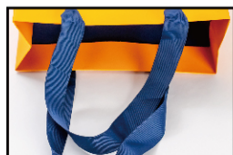
Grosgrain Handle 帽帶