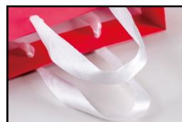
Satin Ribbon 緞帶