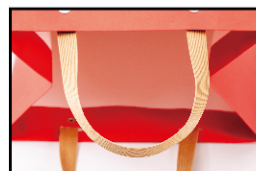
Rigid Flat Paper 硬式扁紙手把