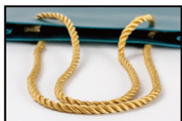
PP Rope 聚丙烯繩