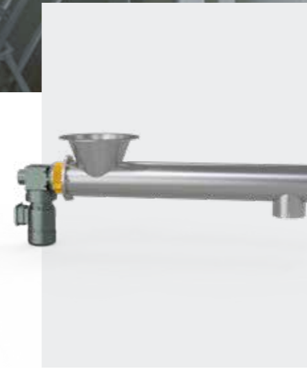
Dosing Screw Feeder