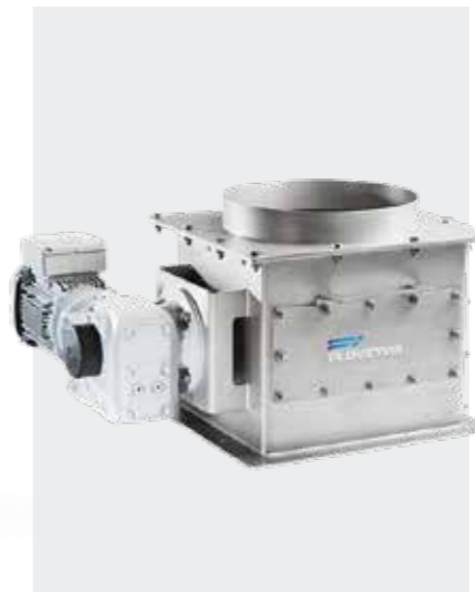
Rotary Lump Breaker