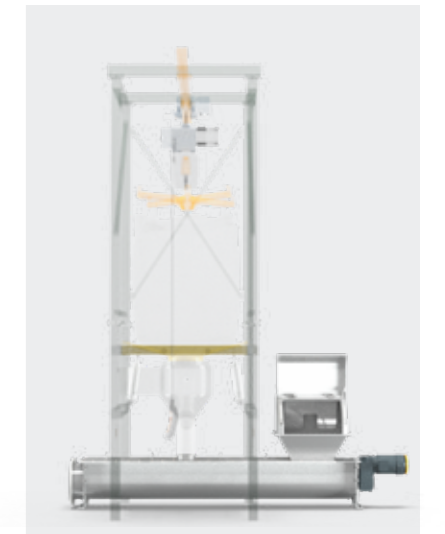
Trough Screw Feeder