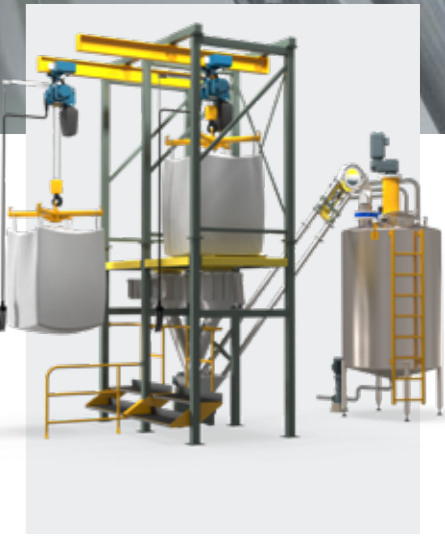
Reusable FIBC Unloader