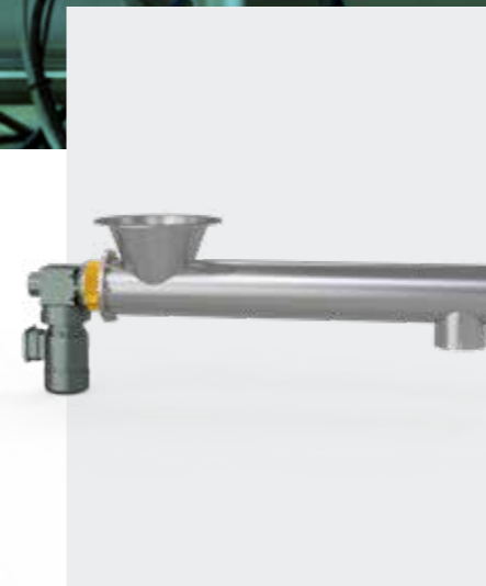
Dosing Screw Feeder