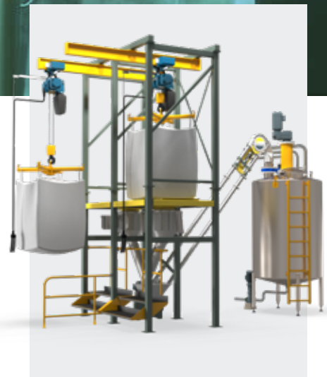
Reusable FIBC Unloader