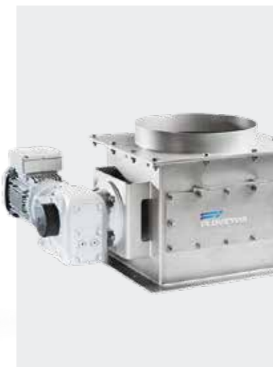
Rotary Lump Breaker