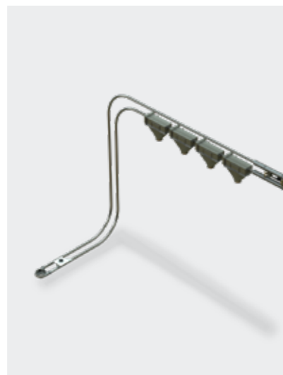
Tubular Drag Conveyor