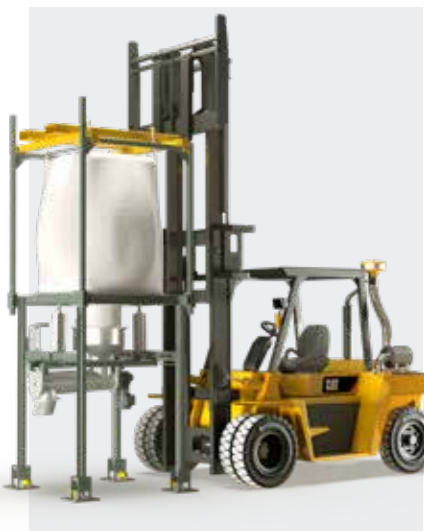
Loss-in-Weight Dosing Auger