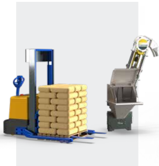
Manual Bag Dump Station