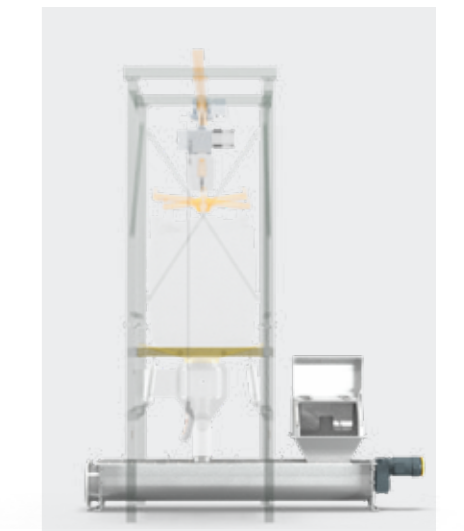
Trough Screw Feeder