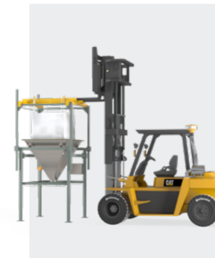
Disposable FIBC Unloader