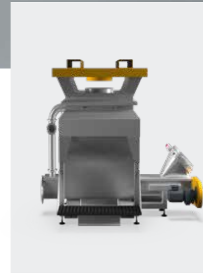
FIBC Screw Feeder