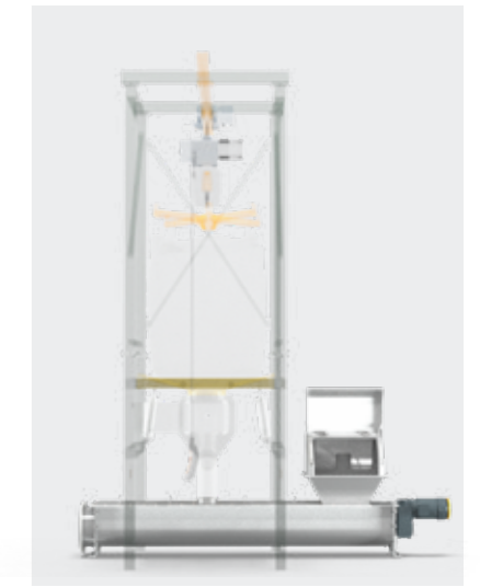
Trough Screw Feeder