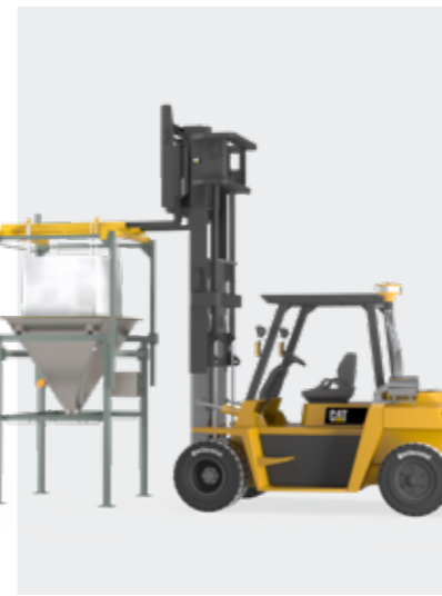
Disposable FIBC Unloader