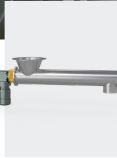
Dosing Screw Feeder