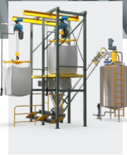
Reusable FIBC Unloader