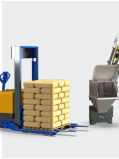
Manual Bag Dump Station