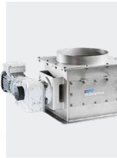
Rotary Lump Breaker