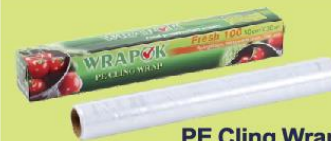
PE Cling Wrap