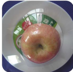
Good air-permeability, extend food's life time