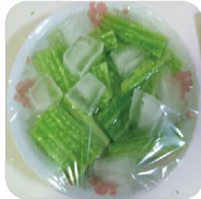
Good stretch, good transparency