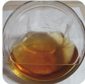
Good sticky, no overflow, no blowing