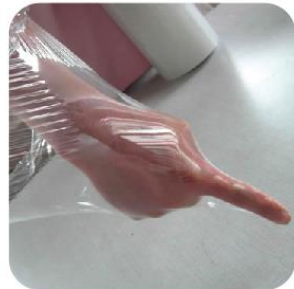
Good strength, good penetration resistance