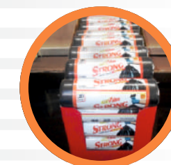
Retail Display tray