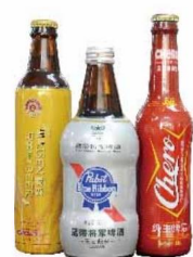
啤酒瓶套标 Berr bottle type