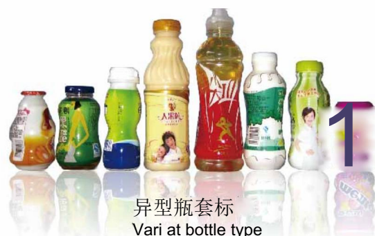
异型瓶套标 Vari at bottle type

Multidirectional Sleeve labell Machine Applications: