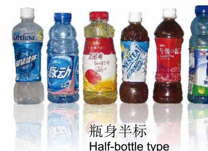
瓶身半标 Half-bottle type