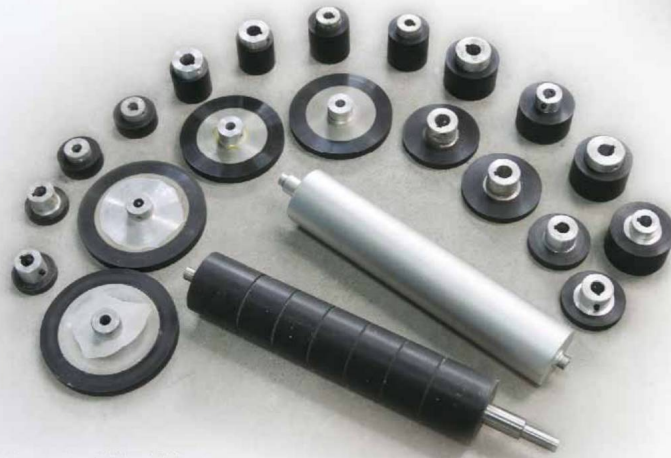
传动胶轮 Driver roller