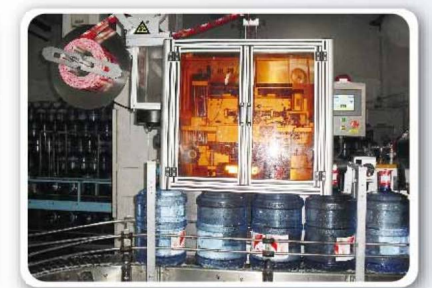
娃哈哈生产现场 WAHAHA PRODUCTION SITE