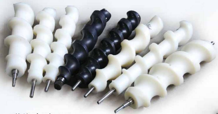
进瓶螺杆 Enter bottle screw

Tel: +86 21 57470260 http://www.chinashousong.com E-mail: chinashousong@126.com