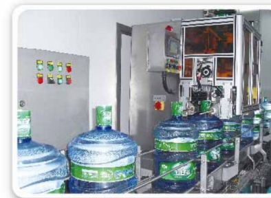
乐百氏生产现场 ROBUST PRODUCTION SITE