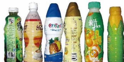
全瓶套标 Full bottle type