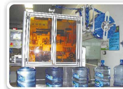
达能生产现场 DANONE PRODUCTION SITE