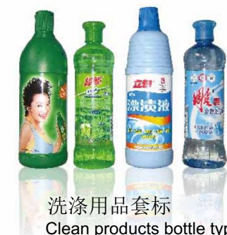
洗涤用品套标 Clean products bottle type