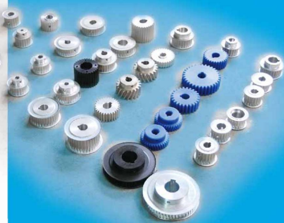
传动齿轮 Transmission gears