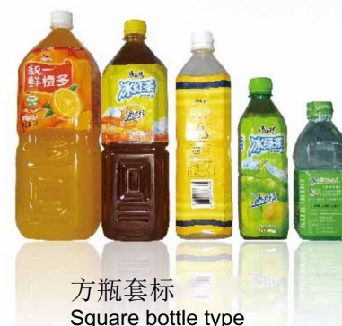
方瓶套标 Square bottle type