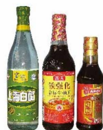
瓶口套标 Cap sealing type