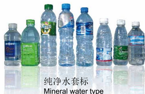
纯净水套标 Mineral water type