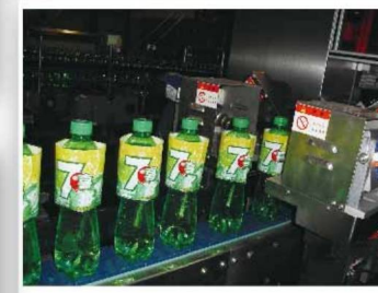
百事可乐 (雪碧生产线)