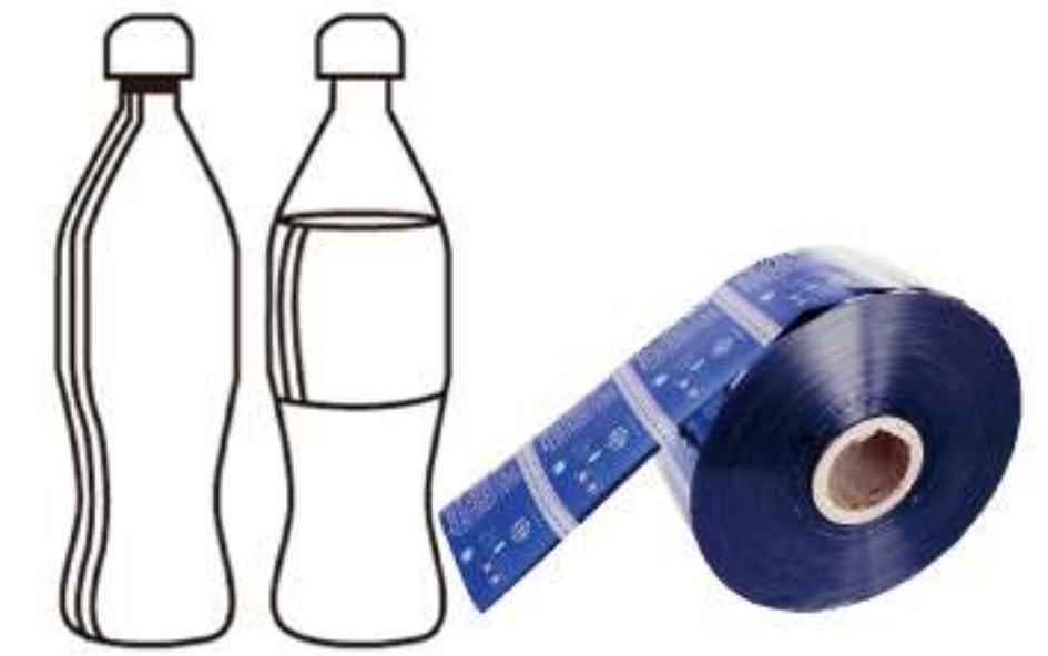
收缩标签膜 Shrink label