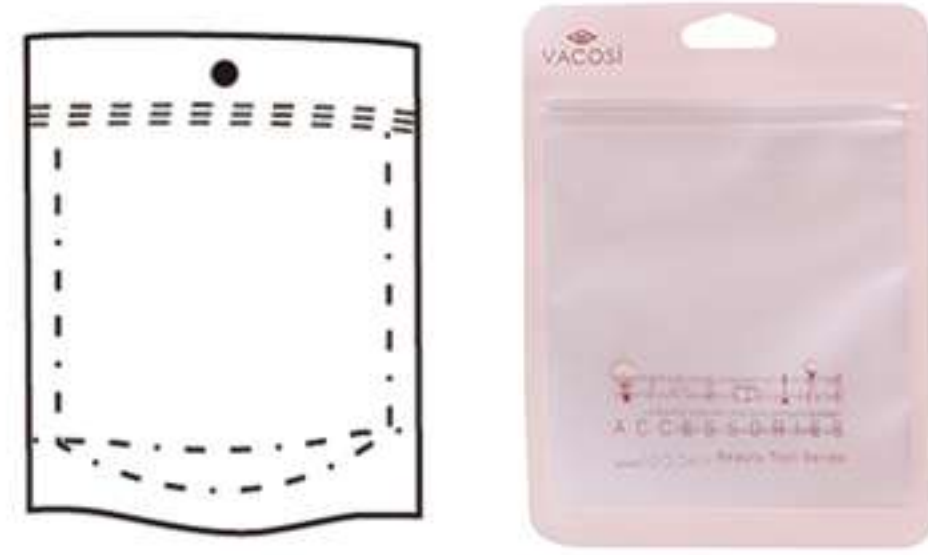
带拉链自立袋 Stand up zipper pouch