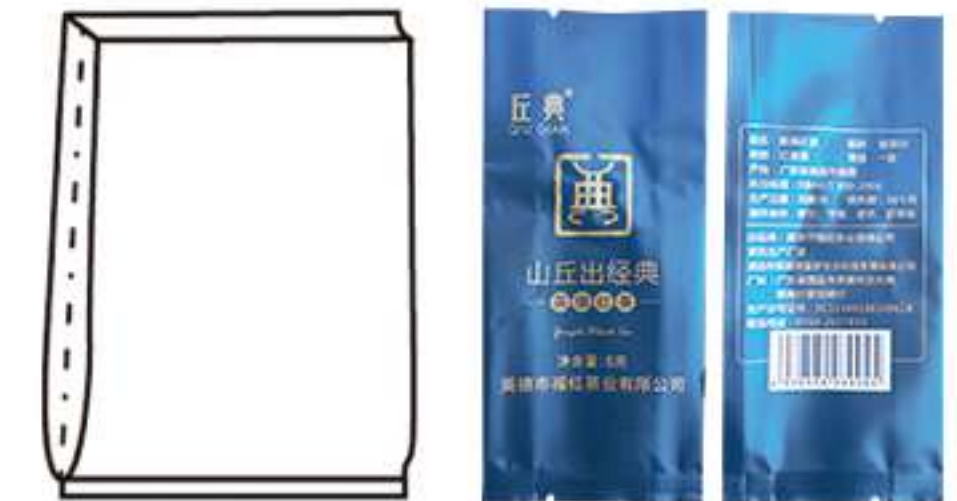
插边中封袋 Fin/Lap seal with gusset bag