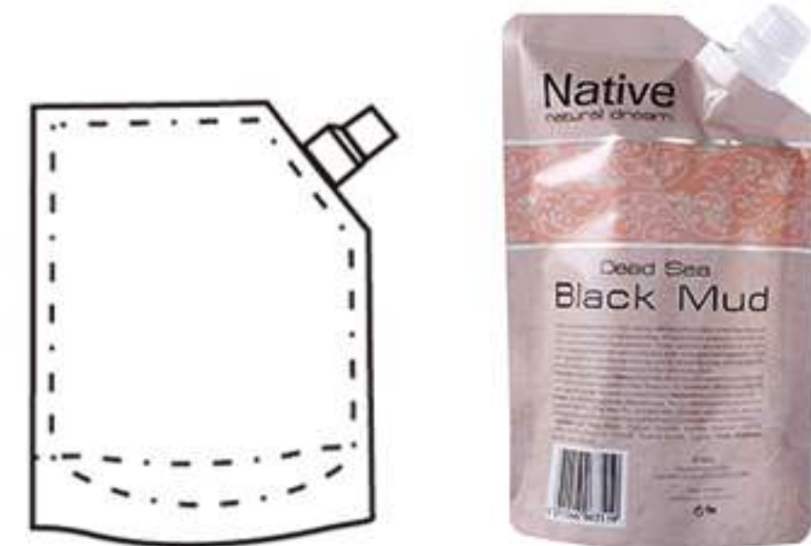
带吸嘴自立袋 Spout pouch