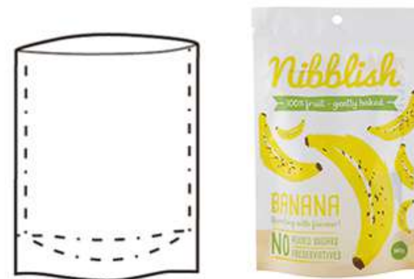
自立袋 Stand up pouch