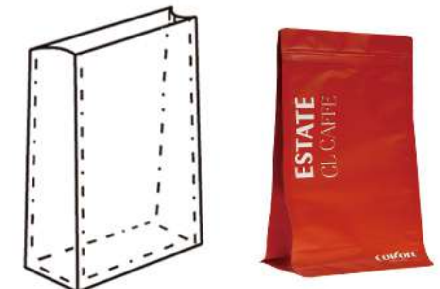
八边封袋 Eight side seal pouch