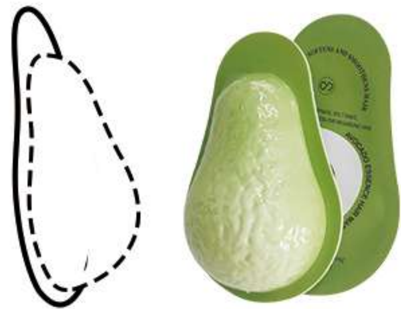
泡罩包装 Blister packaging