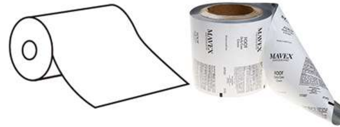
自动包装卷膜 Automatic packaging film