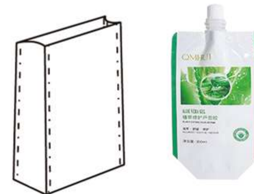
四边封吸嘴袋 Four side seal spout pouch