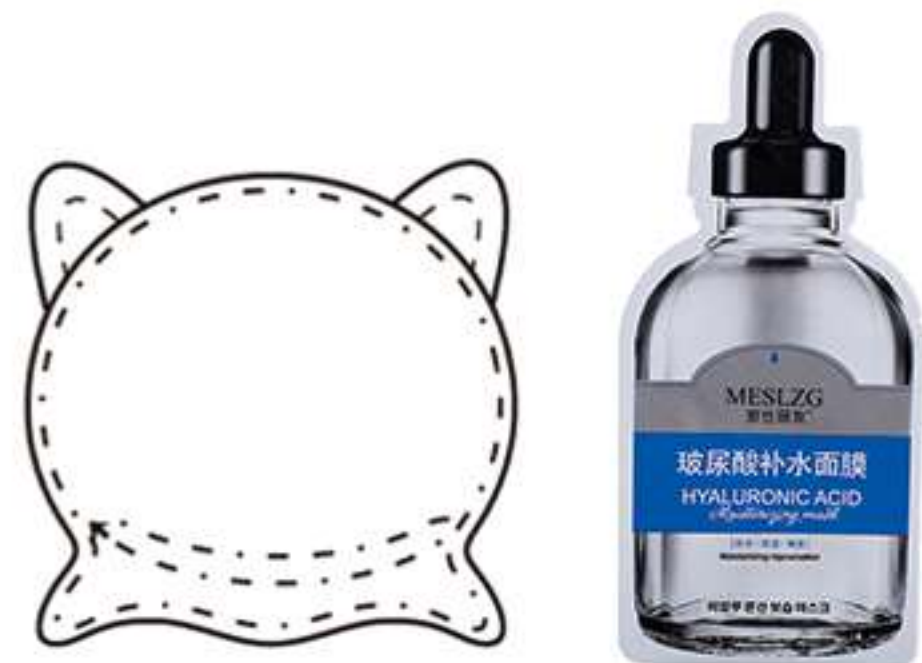
异型袋 Irregular Shaped bag