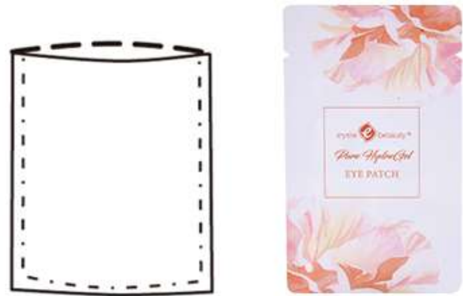
三边封袋 Three side seal pouch