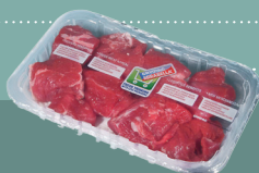
• CRYOVAC MIRABELLA®