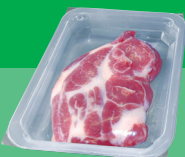
• DARFRESH® ON TRAY