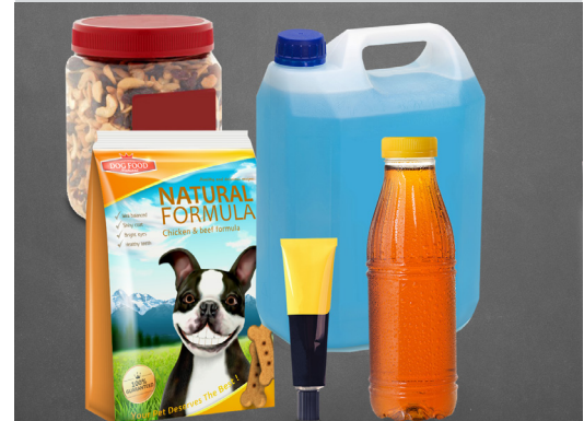
Various products run on the ITL 15