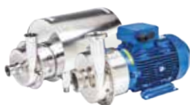
CTI & CTH centrifugal pumps