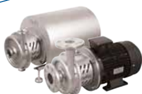
CTX centrifugal pumps