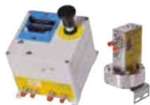
Systems & accessories