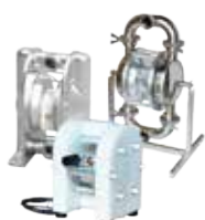
TC Intelligent pumps