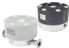
Active pulsation dampeners