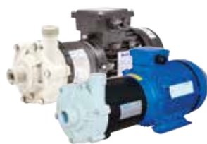
CTM magnetic drive centrifugal pumps