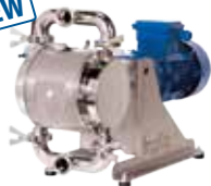
Electrically operated pumps