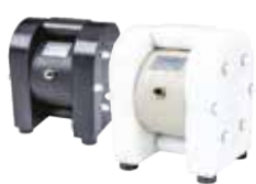
PE & PTFE pumps