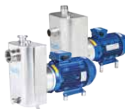
CTS self-priming centrifugal pumps