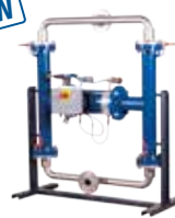
Steinle filter press pumps