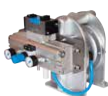
TF Filter press pumps