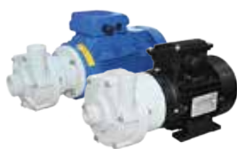
CTP plastic centrifugal pumps