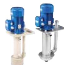
CTV vertical centrifugal pumps