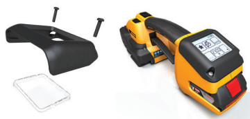
USER INTERFACE COVER For additional protection in harshest environment