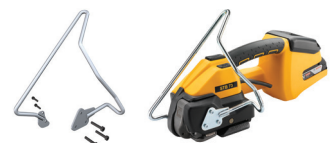
SUSPENSION BOW For stationary application