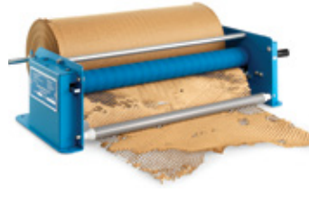
3423 - M4 Dispenser