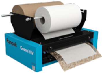
3426 - HV Expander