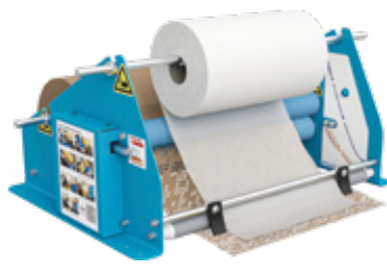
3421 - M3 Dispenser