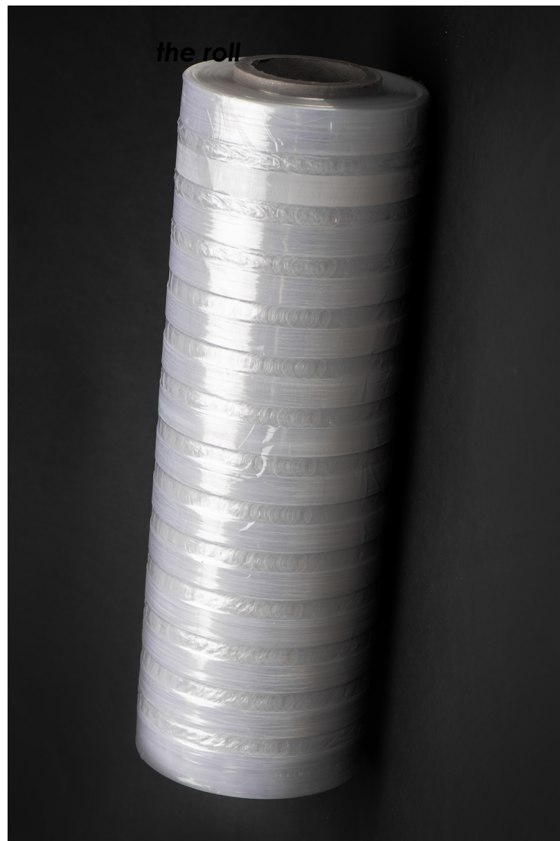
before film is stretched by PSE5100 wrapping machine