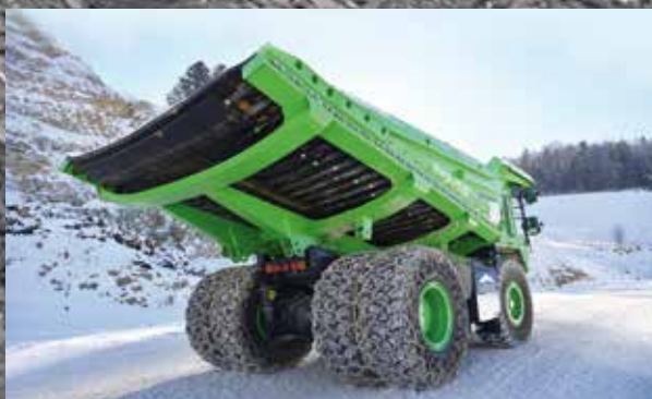
SDB KOM HD605 (e-Dumper) - Switzerland