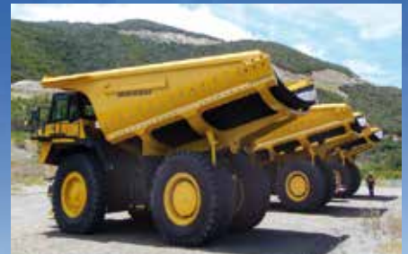
SDB CAT 777 - New Caledonia