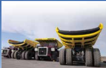
SDB MT4400 - Mongolia