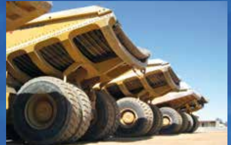
SDB CAT 789C - AUSTRALIA