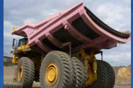
SDB KOM 930E - Canada