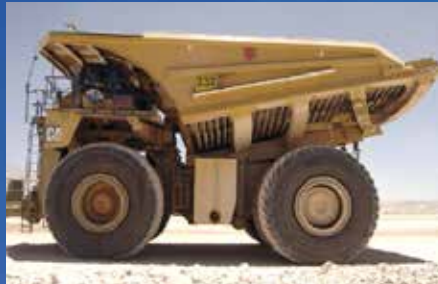
SDB CAT 797 - Chile