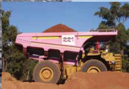
SDB CAT 785 - Australia