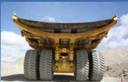
SDB KOM 960E - Chile