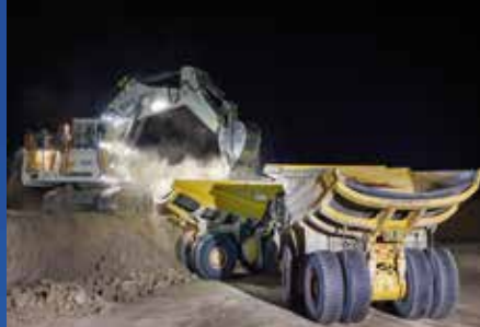
SDB CAT 796 - Australia