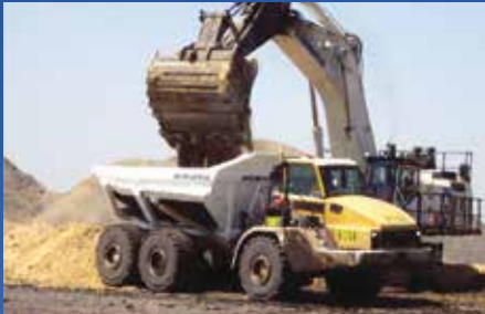
SDB CAT 740 - South Africa