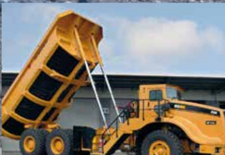
SDB Haulmax 3900D - Canada