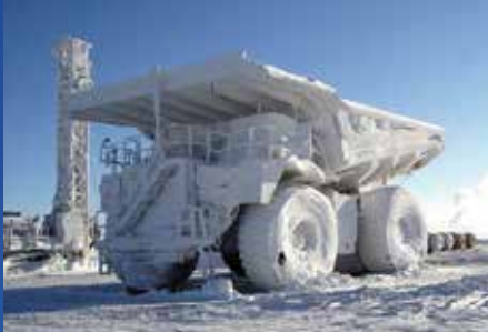
SDB CAT 793 - Canada