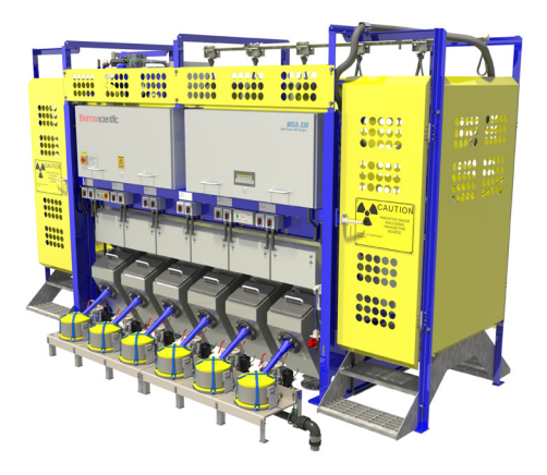
6 Stream MSA-330 Multi-Stream Analyzer with Vacuum Filter Option

The MSA-330 Multi-Stream Analyzer offers the most flexible multi stream elemental analysis solution for process control and monitoring for mineral beneficiation circuits, and can be combined with the Thermo Scientific AnStat-330 to optimise the elemental analysis solution within any existing or new plant.