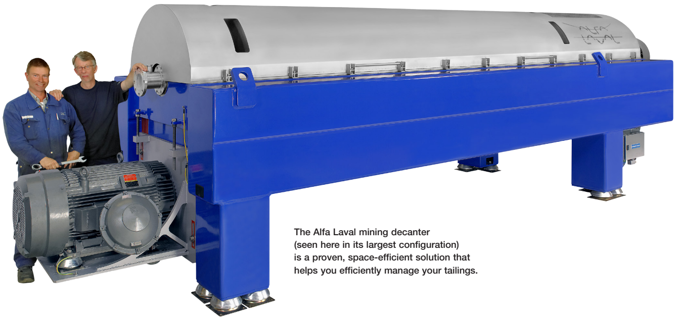
The Alfa Laval mining decanter (seen here in its largest configuration) is a proven, space-efficient solution that helps you efficiently manage your tailings.