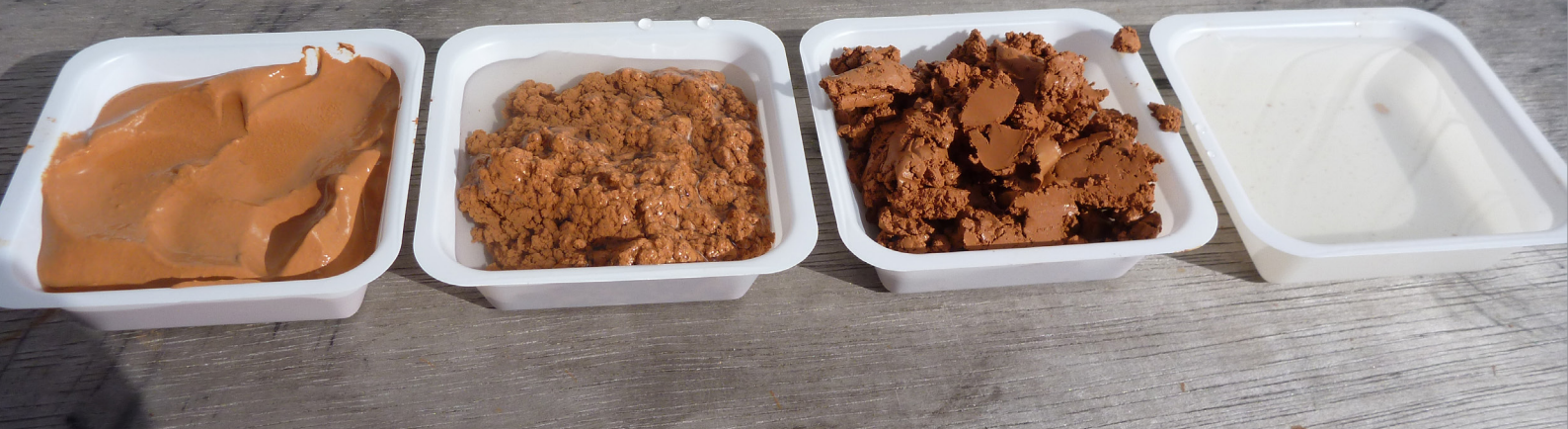
Samples showing the inlet slurry, added flocculant, solid fraction and liquid water phase from a typical mining tailings application.

A large number of tailings dams are still in use. However, in recent years there has been an increased focus on the associated risks and environmental issues. As the walls of tailings dams get higher, the risk of collapse increases, and the potential environmental impact increases dramatically. In recent years there have been several catastrophic events involving tailings dams collapses with severe impact on the environment and bio-diversity. Clean-up operations and re-balancing biodiversity in the wake of these disasters are extremely expensive and can take a long time.