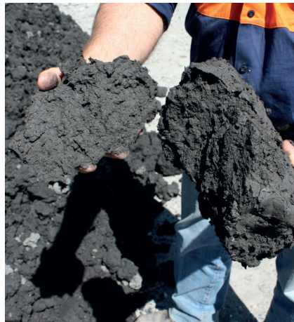
The output from an Alfa Laval decanter centrifuges is sufficiently dry to be stacked.

Our decanter centrifuges are designed based on decades of research and development in challenging industry