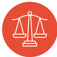
LEGAL & JUDICIAL