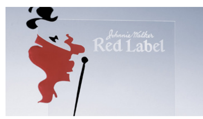
Displays in unusual shapes