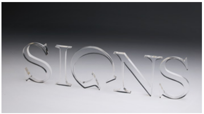
Acrylic letters for various purposes