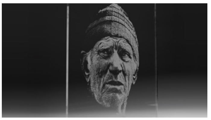
Impressive photo engraving