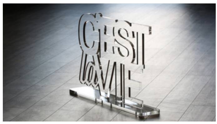
No flame polishing - even with fine inner radii