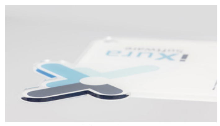
Laser cutting creates crystal-clear cut edges