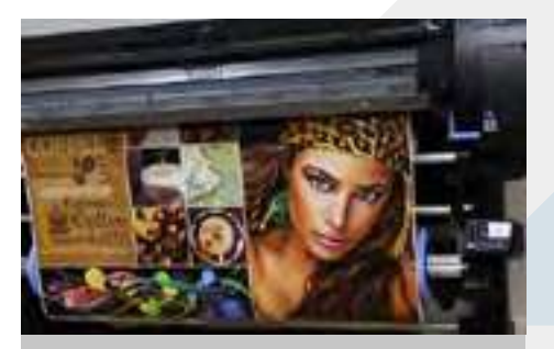
DIGITAL PRINT FILMS A huge selection of films for short, intermediate and long-term applications, including wall, floor and window graphics.

To complement this service, we can also supply you with an extensive range of high-performance tools and accessories used to assist and simplify the way in which films are applied and removed.