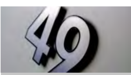
FLAT CUT LETTERS A cost-effective solution when it comes to signage, these can be manufactured out of various materials including aluminium, composite, foamex and Opal acrylic.

Fabricated to specification, Tray Signage is available with Fret-Cut Lettering, Halo Illumination, Push-Through Lettering, Stand-Off Lettering, or a mixture of all four.