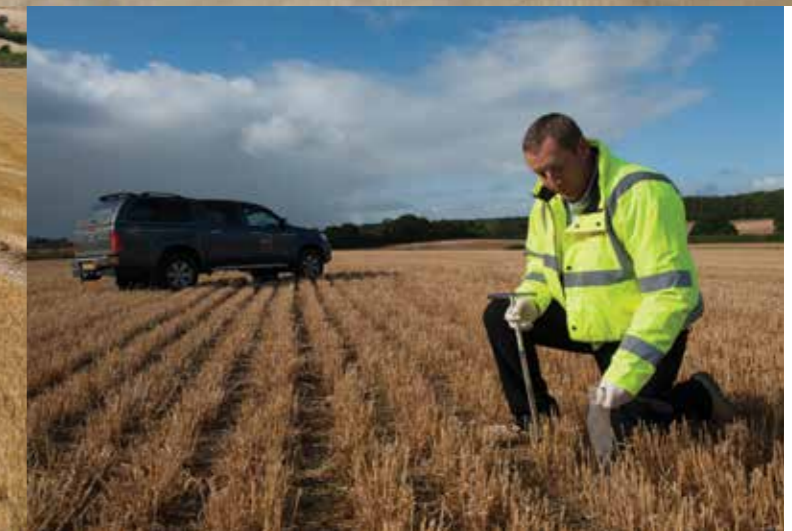
Photographs (Bottom of page 17) Spreading sludge cake in partnership with The ACS Group on behalf of Southern Water.