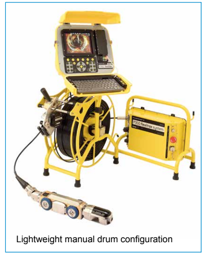
Lightweight manual drum configuration

Wide range of wheels sizes and configurations for use across a wide range of pipe sizes and types