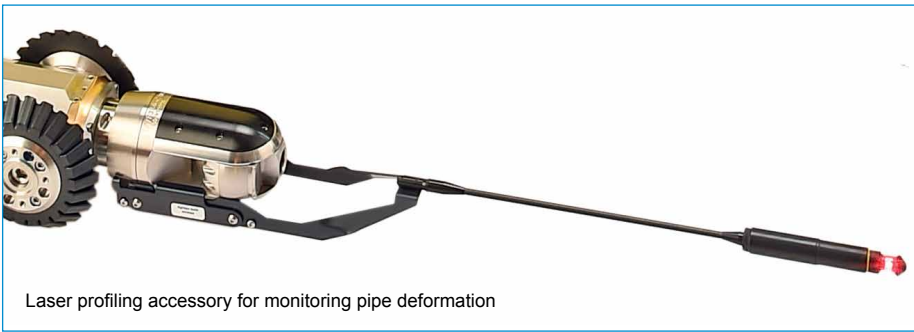
Laser profiling accessory for monitoring pipe deformation