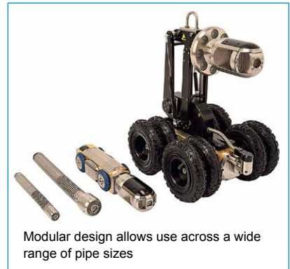
Modular design allows use across a wide range of pipe sizes