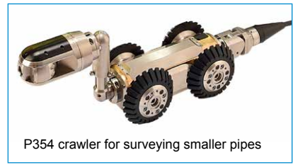
P354 crawler for surveying smaller pipes