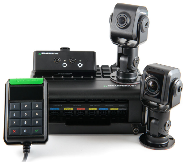
SmartDrive's newest hardware, part of the SmartDrive Transportation Intelligence Platform

Our expert review is a 75+ point quality safety review conducted by certified SmartDrive safety analysts. Expert safety review services combine objective risk observations based upon defensive driving strategies. Individual observations are scored based on customer-defined policies and categorised by severity, making it easy for you to prioritise and focus on the areas of risk you are most concerned about.