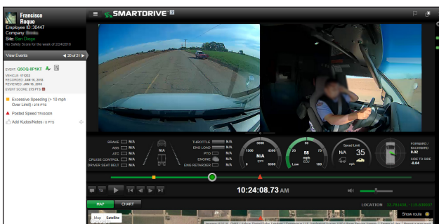
Video Event Player

Our Response Center makes it easy for you to respond with instant access to video, expert analysis, vehicle, driver and active safety system data, all in an intuitive single interface. You can quickly identify problem areas to coach, while also highlighting great driving skills that should be rewarded.