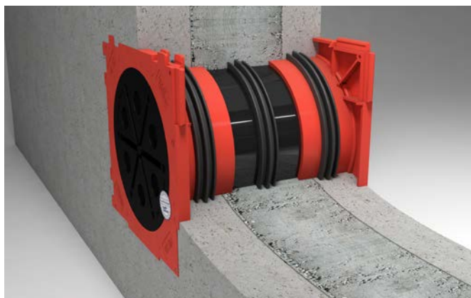
HSI 150-K2-EW/X wall insert for element walls