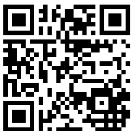
Brochure HSI 150 system

You can find more information about our products at www.hauff-technik.de