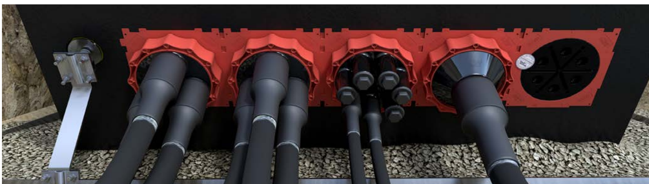
Connection example: sealing of medium voltage cables (HSI 150-D3/58), control and signal cables (HSI 150-D7/33) and low voltage cables (HSI 150-D1/80). Connection of a ring earth electrode to the HEA-IS-M12 insulated earthing entry.

The majority of distribution grid stations in Germany are compact secondary substations. Due to their compact and optimised construction, these secondary substations can even be placed on small plots of land. To make the connection between the cables and the switch gears easier, the cables are mostly fed into the building through cable entries built into the sloping walls due to the limited room available. This means that the minimum bending radii of the cables can be observed.