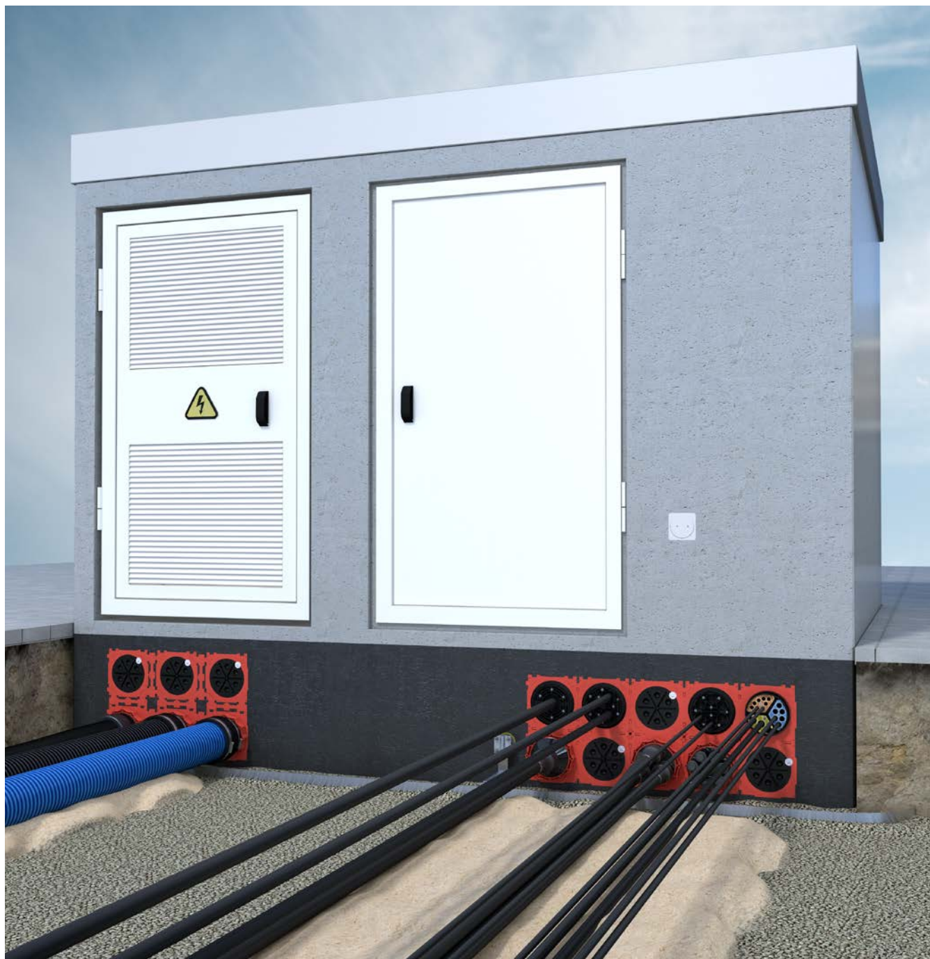
Different solutions for sealing cables and connecting protective pipes in walk-in secondary substations.

Walk-in secondary substations have the advantage that the system can be operated and maintained from within the building and is therefore not dependent on the weather. There are numerous installation possibilities for walk-in substation buildings. As a result, transformers, switch gears, inverters, registers and measuring devices can be integrated. Substations are generally installed above ground, but can also be built into slopes or installed underground depending on the requirements.