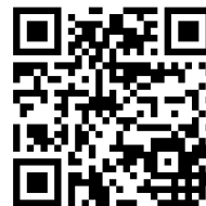
Brochure KES-M 150 system