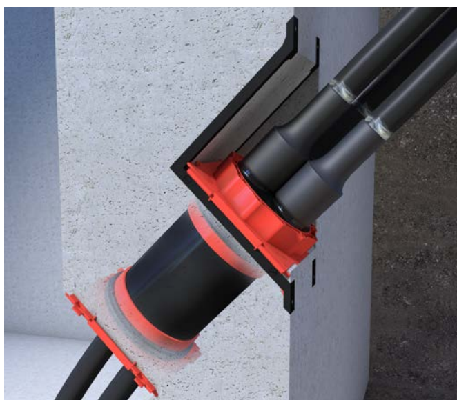
HSI 150-K2 S45°/X slanted wall insert and HSI 150-D3/58 system cover

Double walls/element walls are a special case with regard to sealing. Here, the element walls manufactured in the prefabricated parts factory are grouted on site with in-situ concrete. The multi-layered, non-mono-lithic wall structure of the double element wall requires water barriers in both the prefabricated parts and the in-situ concrete. Hauff-Technik provides different solutions for cable and earthing entries here – they are always recognisable by the three 3-ribbed seals made of TPE (thermoplastic elastomer).