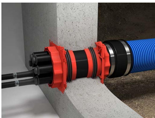
HSI 150-K2/X double wall insert, HSI 150-D7/33 system cover, KES-M 150-D pipe connection with sleeve and spiral hose 14150

Slanted wall inserts are available for 30, 45 and 60° angles and are supplied ready for installation flush with the formwork. Slanted entries are used, for example, for substations integrated into the basement of buildings or in rooms where there is limited space. Thanks to the slanted entry of the cables through the wall, the cables can be laid and connected in accordance with the minimum bending radii.