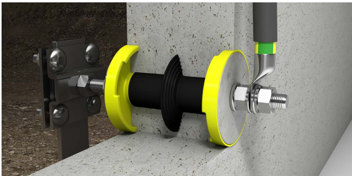
HEA-IS-M 12 earthing entry: a flat steel connection via the Z-KG-M 12 cross-clamp on one side and an earthing conductor connection via the Z-B-M 12 connection bolt on the other side.

for secondary substations and industrially manufactured engineering buildings