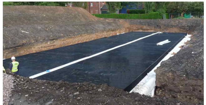
Photo is taken during a multi layer installation with a central porous pipe distribution within the bottom layer. Surface water is fed through the system to a Vortex Flow Control at the exit which when operational backs up the flow to fill the attenuation structure. Hydrocarbon removal is through Naylor Smart Filters.