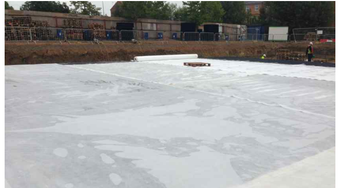
Photo shows a multi layer soakaway being installed with geotextile surround. This large soakaway has high level entry points, inspection routes to ensure no silt build up and is positioned beneath a very large car park.