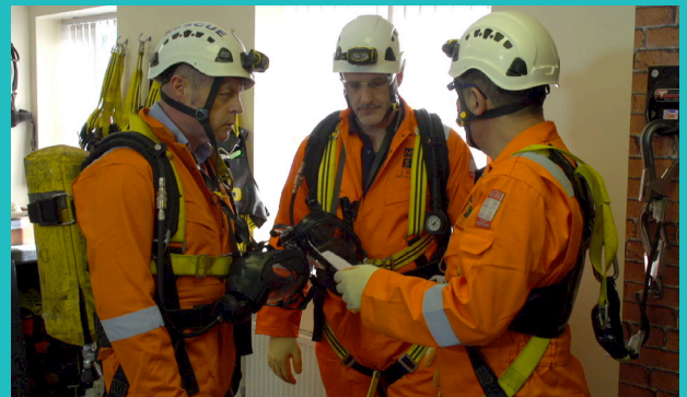
Planning and team briefings