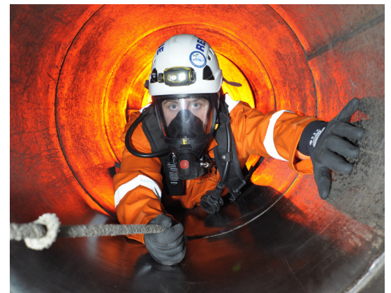
Confined space training