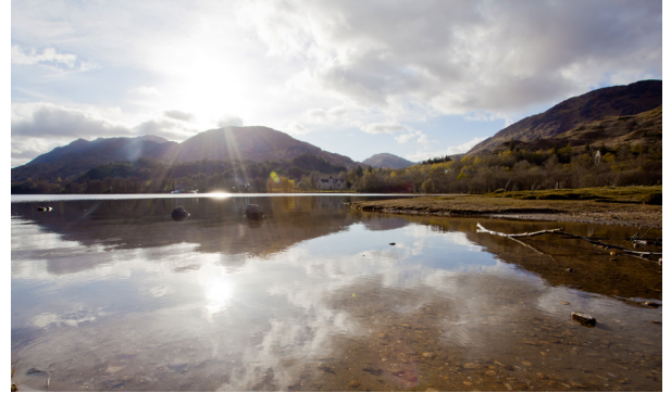
Highlands and islands