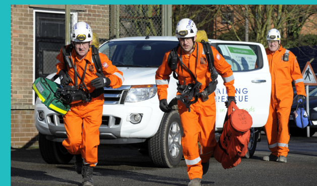
Our rescue operatives, ready to respond