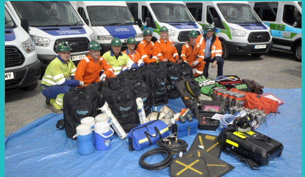
Our fully equipped, rapid response vehicles