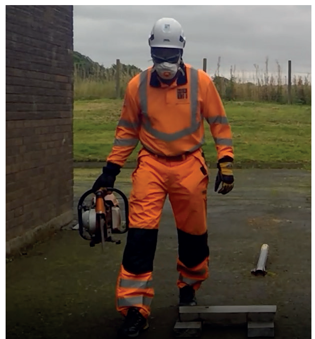
Virtual abrasive wheels training