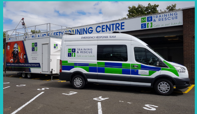
Our training vehicles