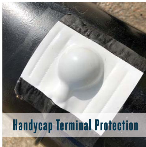
Handycap Terminal Protection