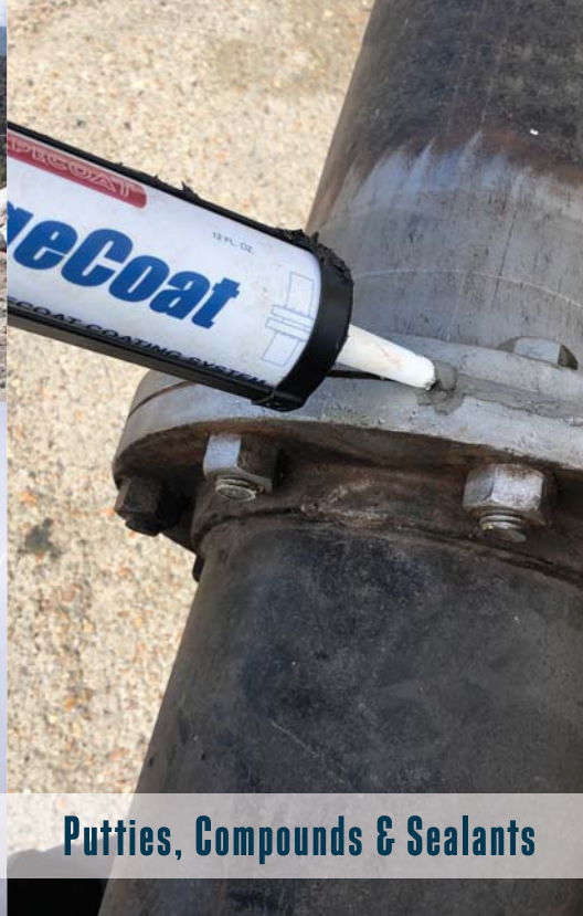
Putties, Compounds & Sealants