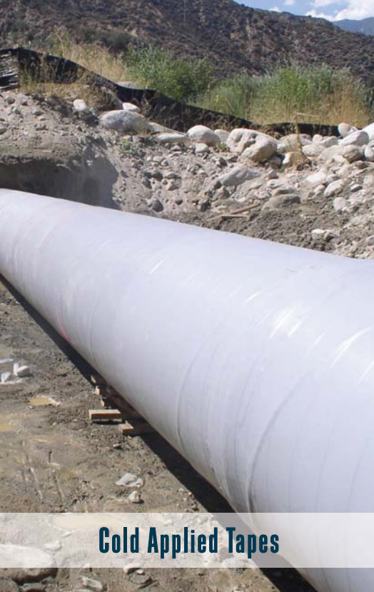
Cold Applied Tapes