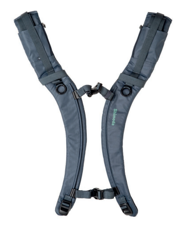
Tech Strap - Standard

Ideal for adventure photographers with a medium bust and medium shoulder width.