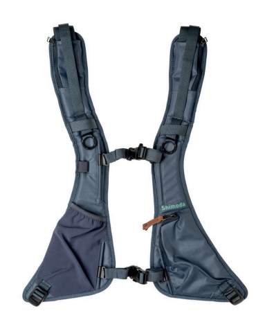
Simple Strap - Standard

Ideal for adventure photographers with a small bust and medium shoulder width.