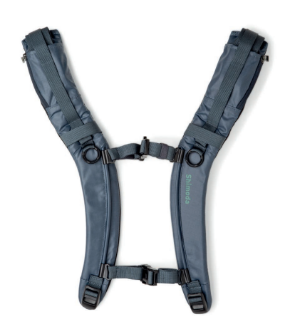
Simple Strap - Petite

Shimoda's series of three shoulder straps are designed specifically for women, constructed around pressure points across the chest and under the arm to provide a secure and comfortable fit. Women's shoulder strap models feature a new dual-sternum strap configuration which contours and fastens around the chest and relieves unnecessary and uncomfortable pressure. The contoured shapes, positioning of the sternum straps and high-quality materials all complement the already adjustable torso settings of current Shimoda backpacks.