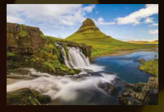
then be the amount of stops needed in the ND filter to use for that scene.

Instead of reducing the ISO to limit light, you can add a Neutral Density filter to limit light, and can then set the shutter speed according to the particular motion desired (blurring water movement, for example) and the aperture set as needed (small aperture for maximal sharpness or large aperture for narrow depth of field (subject in focus and background out of focus). Using your camera, you will see the image right away and can choose the best ND filter to use for the scene being captured by first knowing the best aperture to use for maximal sharpness desired. The shutter speed would be selected by finding the desired blur from subject movement. The camera would be set up for these in manual mode, and then the overall exposure adjusted darker by adjusting either aperture or shutter speed, noting the number of stops needed to bring the exposure to that which is desired. That offset would