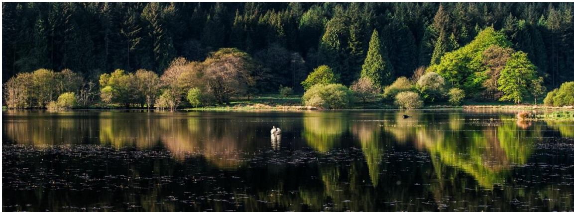
Talybont on Usk Reservoir: near to home of Creative Photography Wales