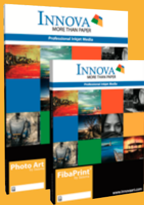
Photo Art by Innova

Alongside the matte papers in the Innova Fine Art range, we also offer a selection of semi-matte and gloss papers. Fully compatible with both pigment and dye inkjet. The range also includes digital darkroom papers from our ground breaking FibaPrint® portfolio, ideal for fine art photographic prints.