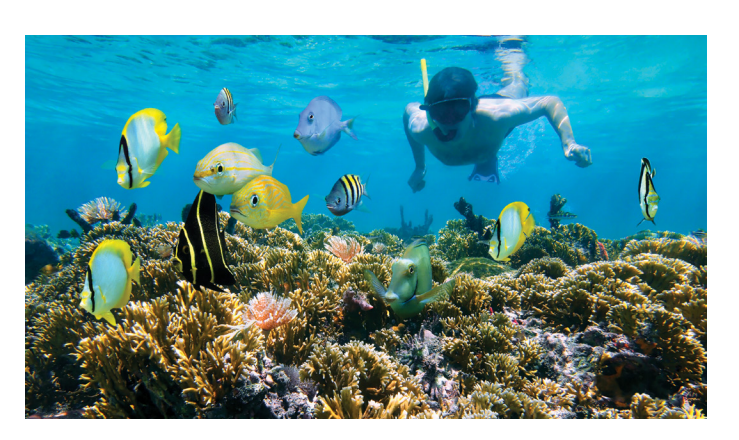
Snorkelling# • 00 - • •0

Get under the surface of the sea and discover the hidden wonders of the underwater world with some of the world's best dive masters.