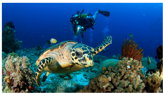
Scuba Diving~ 000-000

Silent and sleek, sea kayaks are perfect for exploring wild coastlines, allowing you to get up close with the amazing wildlife.