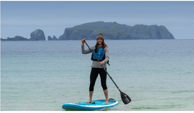
Stand-Up Paddle Boarding (SUP)#

Witness wildlife in action and marvel at the fascinating display of life under the water as you snorkel and drift along at a leisurely pace.