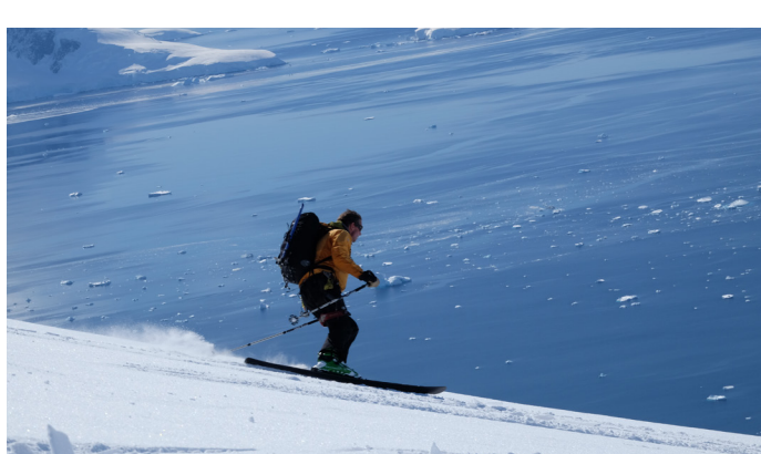
Ski & Snowboard Touring*

Get a glimpse of how intrepid explorers would have traversed Antarctica in the past by participating in our snowshoeing activity.