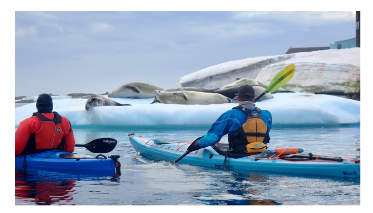
Sea Kayaking 000-000

Choose from a large selection of optional activities that can be enjoyed multiple times throughout your voyage. Led by our professional and passionate expedition team, we aim to get you out on your optional activities as often as possible, whenever conditions allow. (Additional charges apply for optional activities).