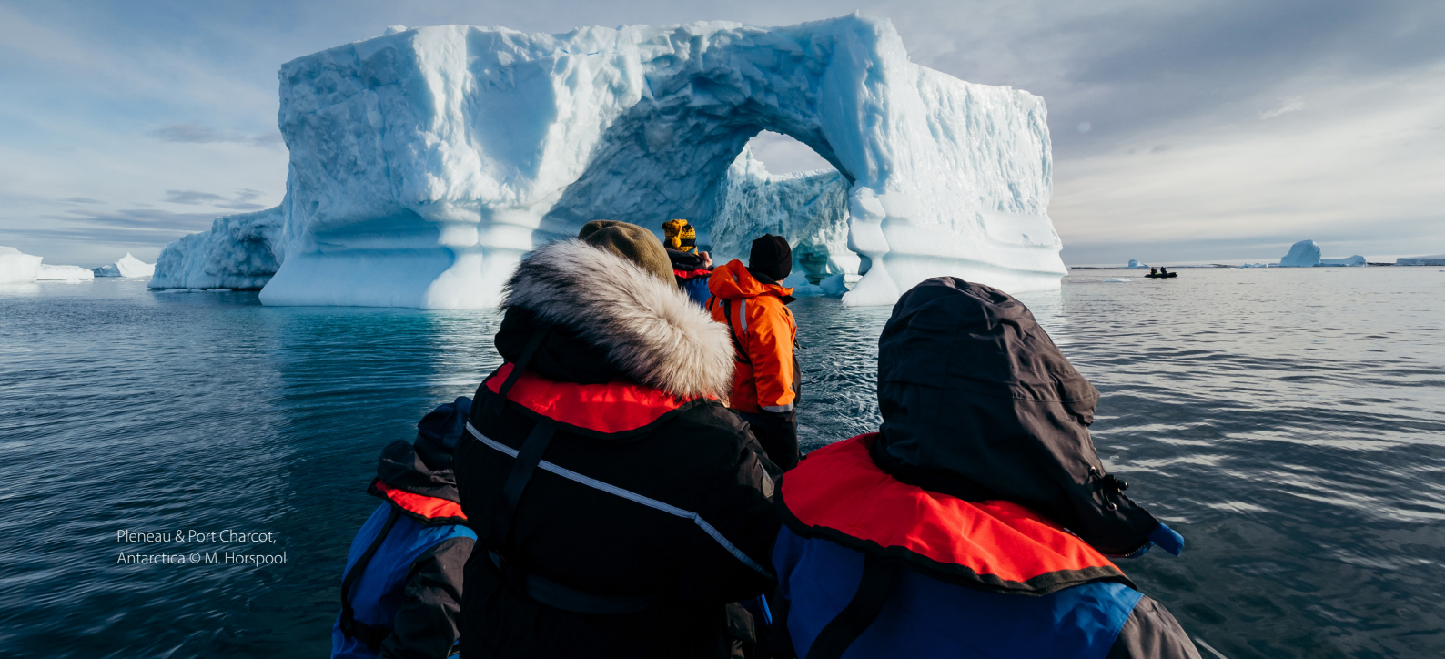
Pleneau & Port Charcot, Antarctica

We have already hosted a number of focused groups in our 2022 Antarctic season, including over 50 photographers, birders and wildlife enthusiasts. Our unique style of expedition and highly experienced teams onboard make group travel with us seamless. Whether you are an agent seeking to take a group directly or a professional photographer promoting a group to your base, we have the best voyages and team to support you.