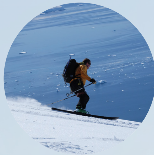
Ski & Snowboard Touring