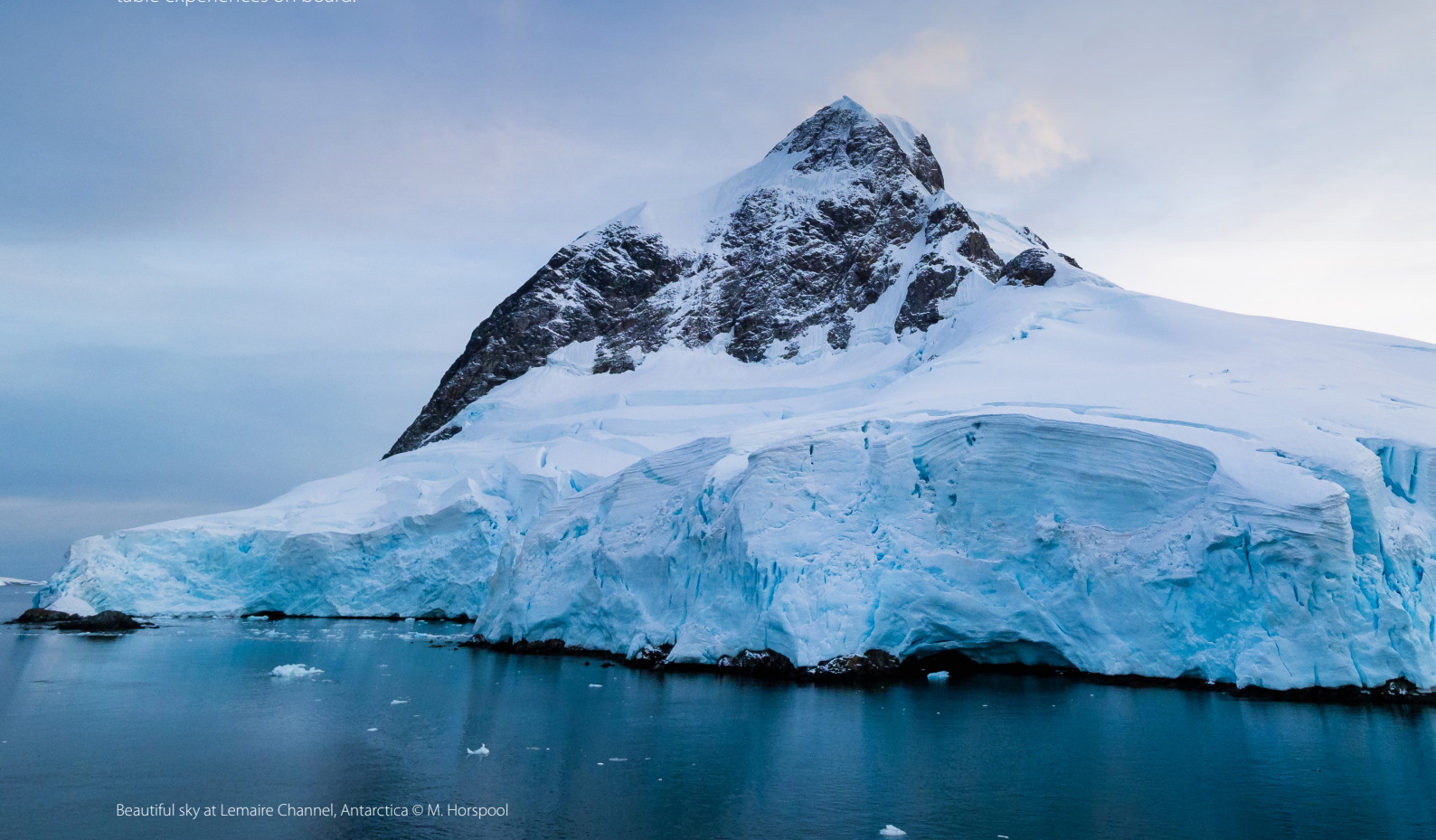
Beautiful sky at Lemaire Channel, Antarctica

We are setting up and improving regional supply chains. We are working closely with suppliers that encourage regenerative farming and nature-based farming principles. We engage with suppliers in Europe, Chile, Argentina and the US to deliver regionally inspired farm-to-table experiences on board.