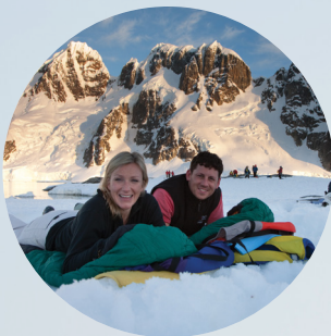
Camping in Antarctica