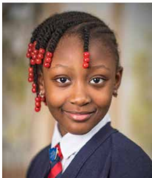
Example post from Nice Smile Ltd