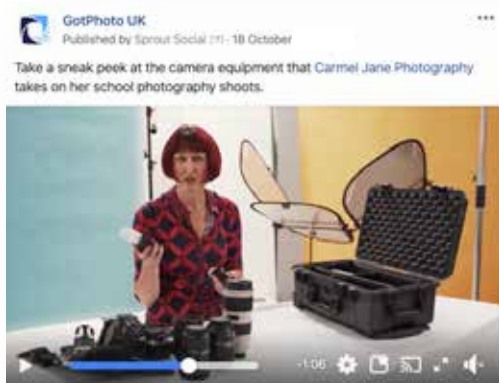
Example post from GotPhoto