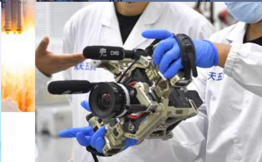
Passed the rigorous condition tests