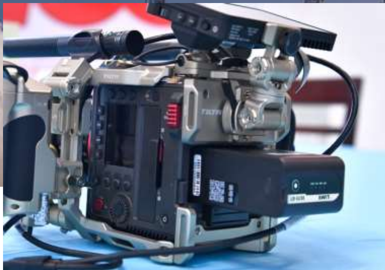
SWIT LB-SU98 Li-ion Battery Pack

Safe and Reliable Battery for the Space Station Carrier Rocket on Sept 2021