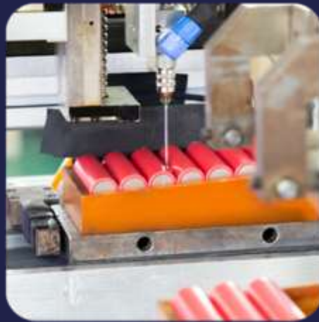
Automated Bonding Assembly