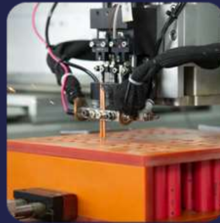
Automated Cell Spot Welding