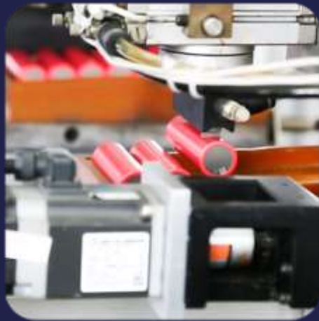
Automatic Cells Screening