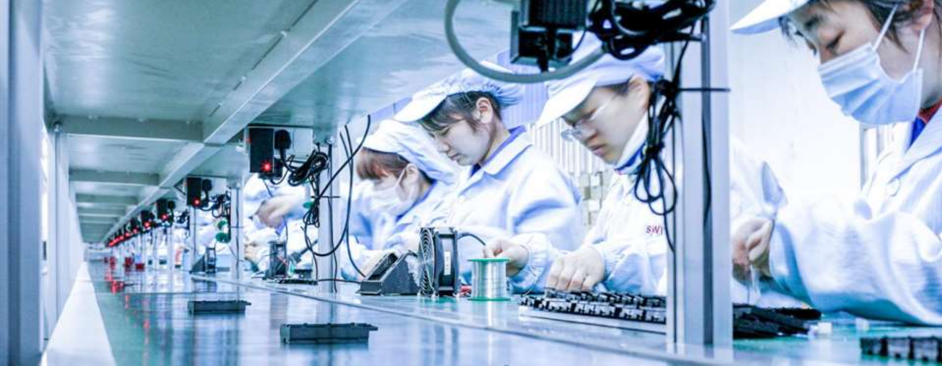
SWIT Production Line