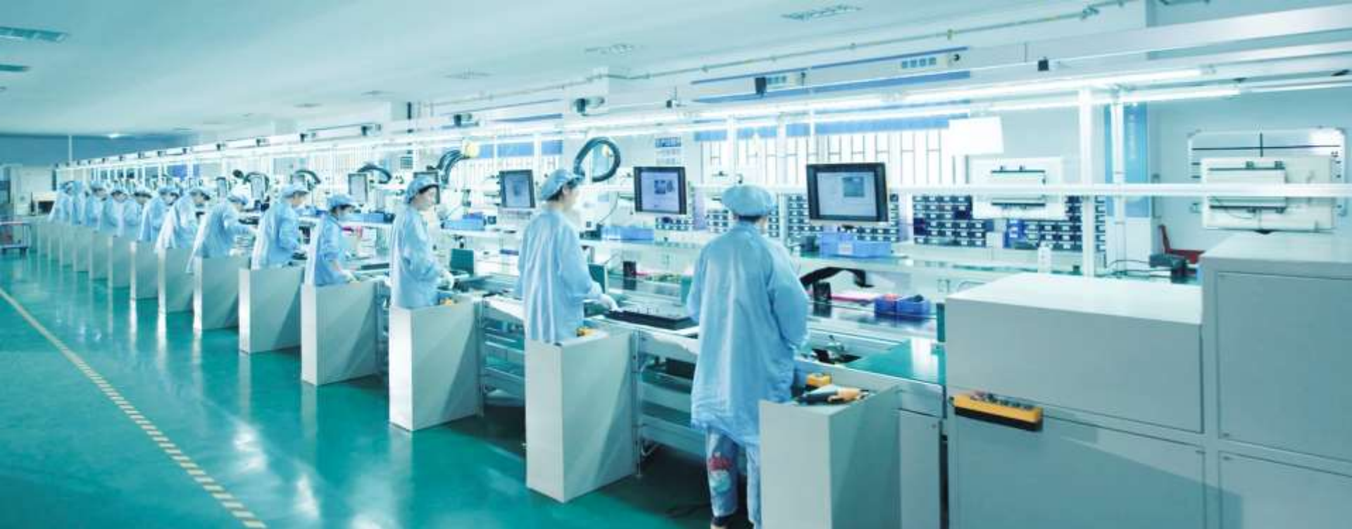
SWIT Production Line