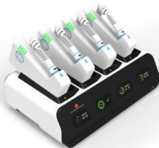
SWIT DB-T95 Li-ion Battery and Charger