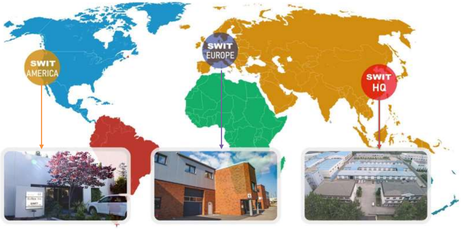
SWIT America Santa Clara, CA, USA