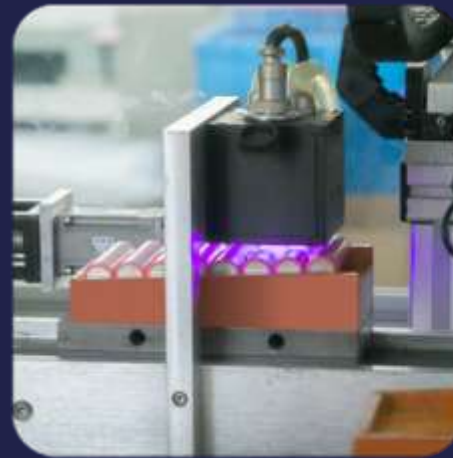
Automated UV Rapid Drying