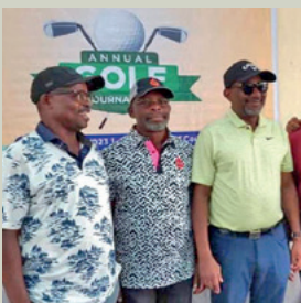
PETAN golf day

SAIPEC enables networking, partnership formation, and business development, leading to potential investment opportunities and collaborations that can advance the industry growth and competitiveness.