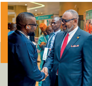
Daily networking breaks