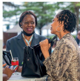
VIP cocktail receptions