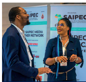
Daily networking breaks