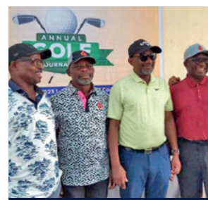
PETAN golf day

SAIPEC offers an exceptional platform for networking, with countless opportunities to connect throughout the event from daily coffee breaks and dedicated networking sessions to evening receptions and the PETAN Golf Day.