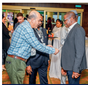
VIP cocktail receptions