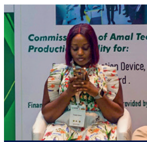
SAIPEC Event App