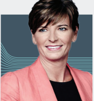
Moderator: Becky Anderson Managing Editor, CNN Abu Dhabi & Anchor, CNN International