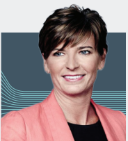
Moderator: Becky Anderson Managing Editor, CNN Abu Dhabi & Anchor, CNN International