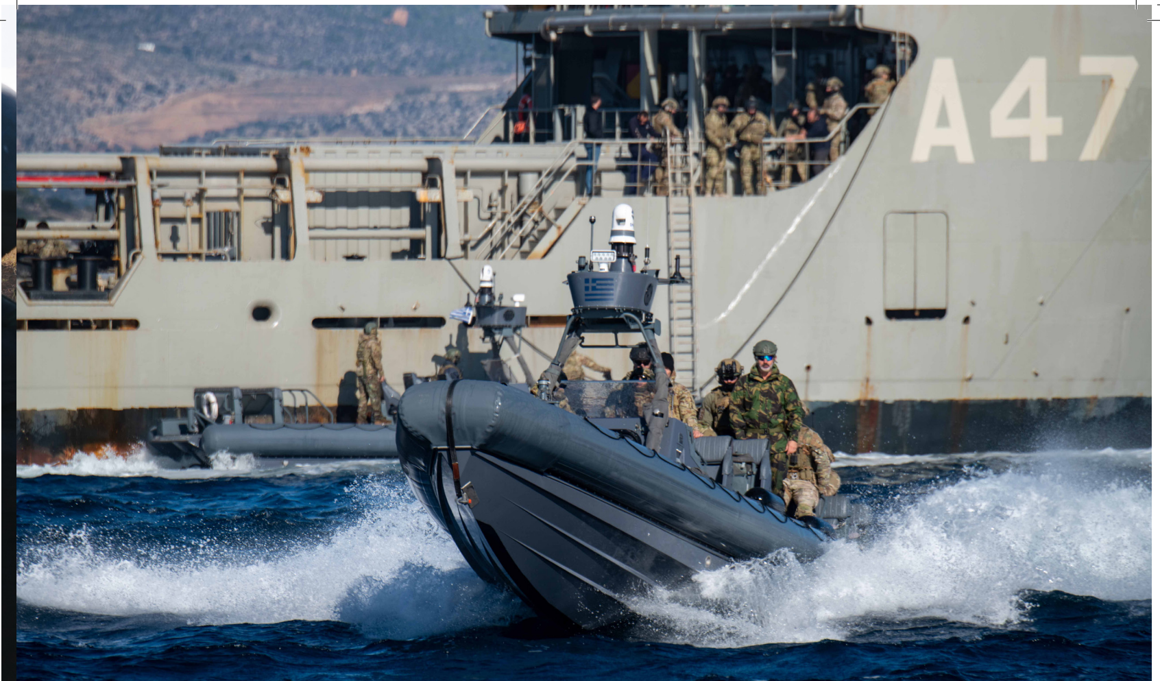
East-coast based U.S. Naval Special Warfare Operators (SEALs) conduct visit, board, search and seizure training with Allied Special Operations Forces near Athens, Greece.

USSOF and leading-edge defense industries. Initiatives like SOFWERX and recommendations from the Atlantic Council's Commission on Innovation Adoption can facilitate this collaboration, ensuring a culture of operational experimentation and incentivizing private-sector engagement to support USSOF's mission success. Appropriately resourced, USSOF can continue to advance innovation adoption for the Joint Force at a time when doing so is essential for strategic competition.