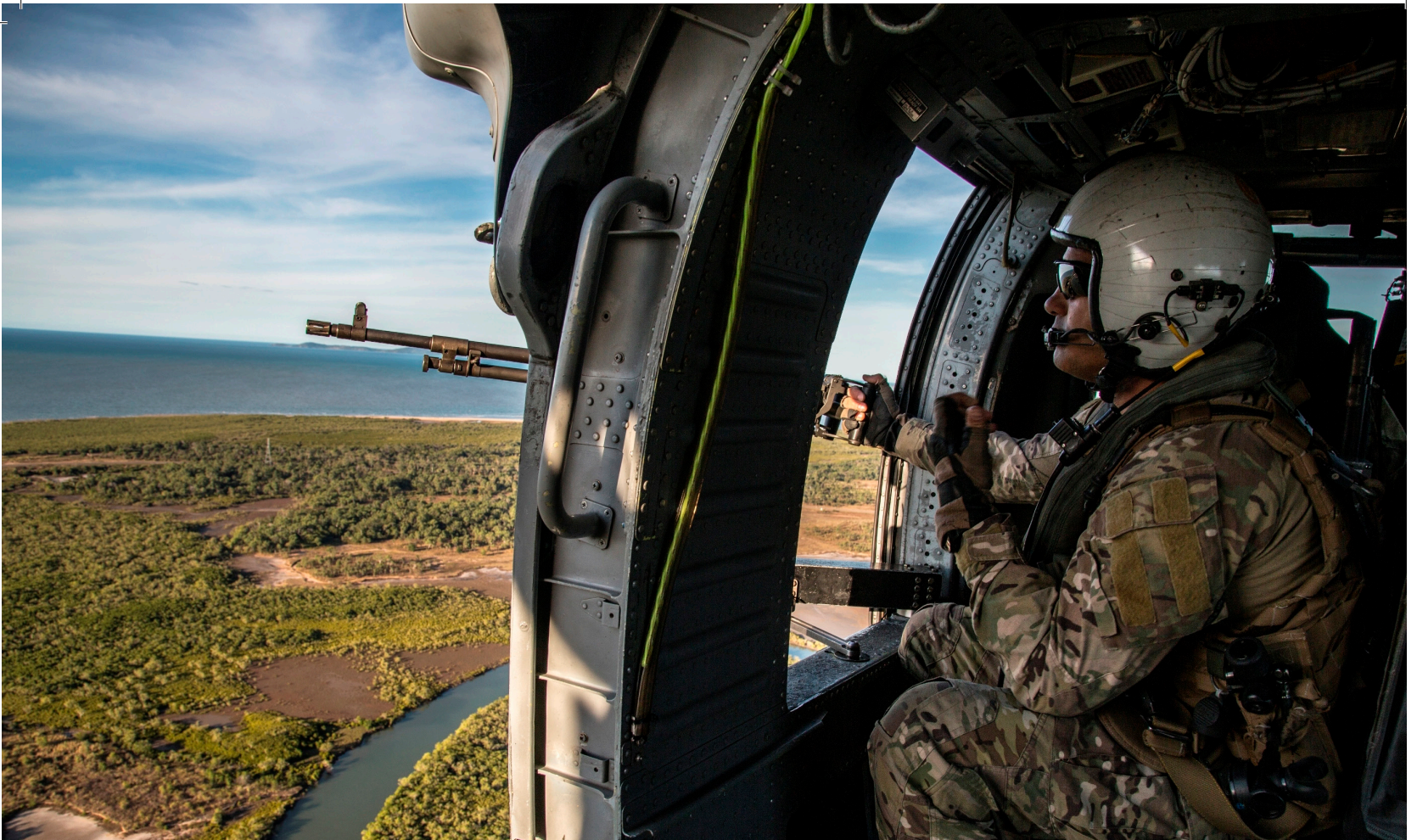
A crew chief with Helicopter Sea Combat Squadron 85 (HSC-85) scans the skies while on a mission to emplace US and Australian Special Operations Forces (SOF) during Talisman Sabre.

These truths echo the fact that a small number of SOF operators—carefully selected, well-trained, and exceptionally led—offer an unorthodox or specialized approach to security challenges that cannot be replicated at a larger scale across the conventional military force.