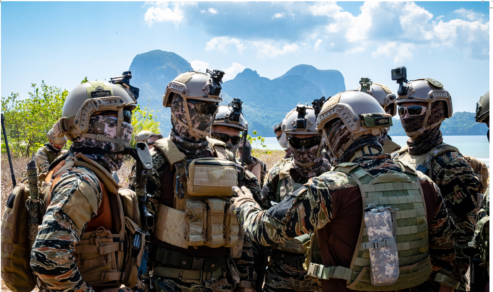
Members of the U.S. Naval Special Warfare Operators and Australian Defence Force conduct training with their Armed Forces of the Philippines counterparts during Exercise Balikatan 2019 (BK19).