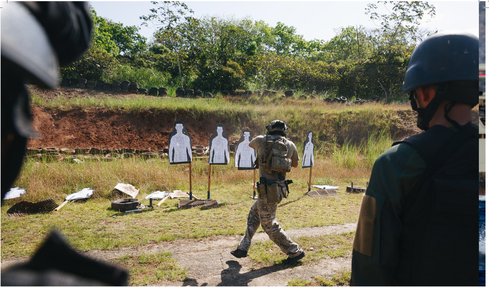
A U.S. Army Special Forces Soldier demonstrates lateral marksmanship drills to U.S. and Panamanian security forces during joint combined exchange training in Panama City, Panama.

strategic planning, the DOD can leverage USSOF's capabilities to their fullest extent, ensuring a proactive and comprehensive approach to strategic competition.