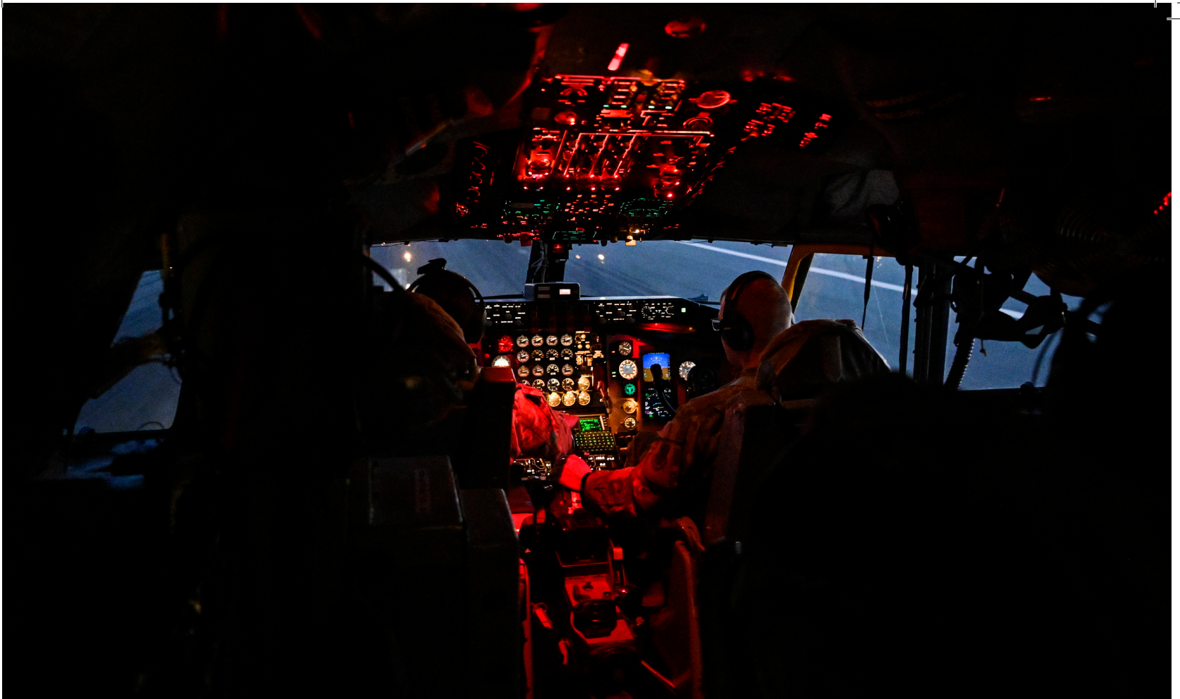
A U.S. Air Force KC-135 Stratotanker aircrew with the 340th Expeditionary Air Refueling Squadron, deployed to Al Udeid Air Base, Qatar, take off from Al Udeid AB.

in the event of a conflict, but also, if USSOF capabilities are employed only at the onset of a conflict, they will not have been employed to their full effect.