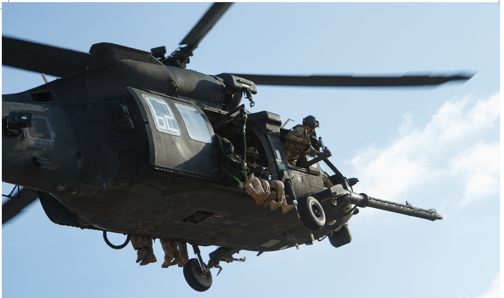
Chile and US Special Operations Forces prepare to fast rope to a simulated objective during exercise Southern Star in Mejillones, Chile.

decisions and operations in those local contexts. USSOF's enduring partnerships allow the United States to engage with nations in areas of strategic competition by assisting them with the problems they care about most. This is especially important for certain partners that may not view China or Russia as a threat, leaving USSOF as one of the only viable and trusted partners to discreetly engage on US foreign policy matters in certain areas.