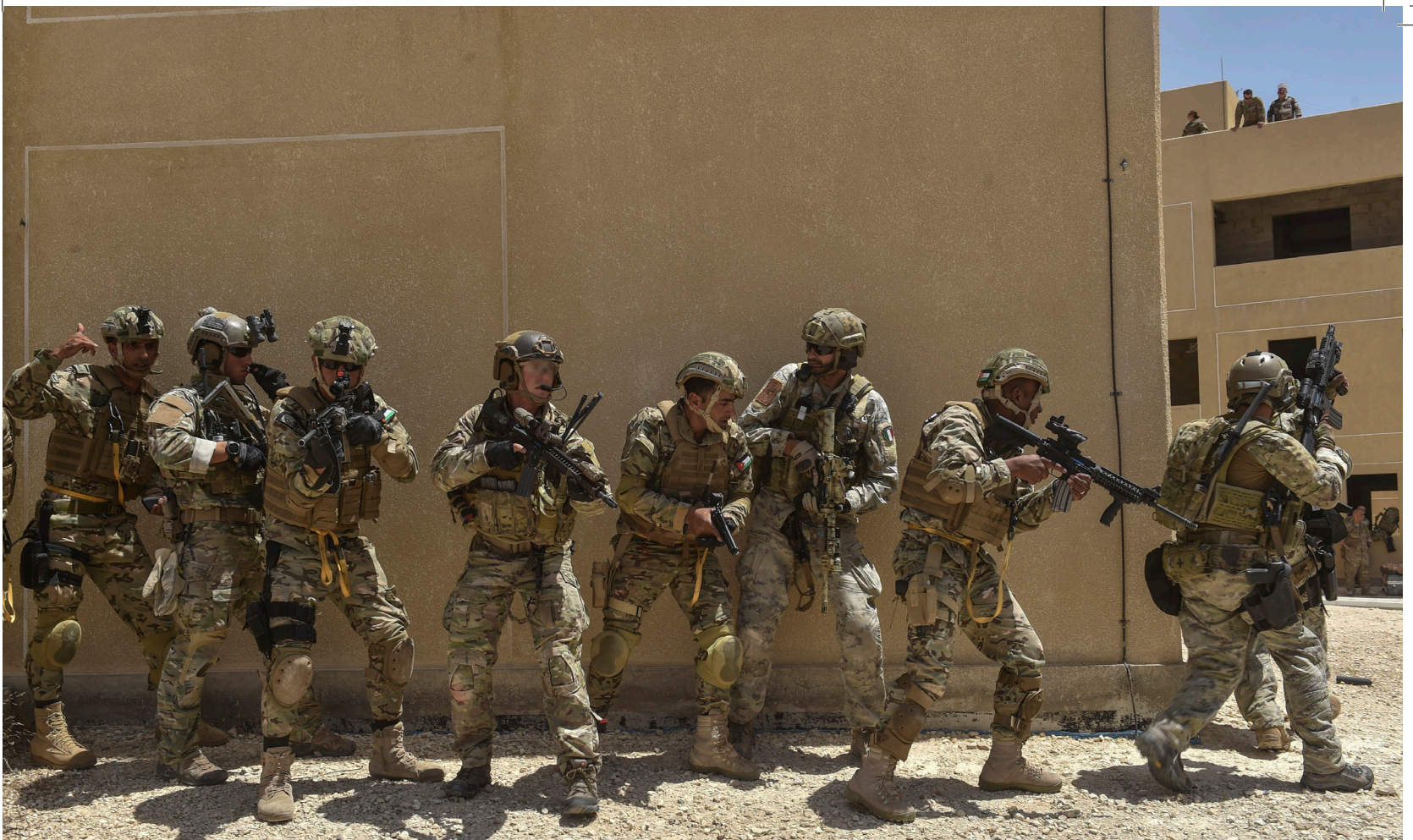
Italian special operations forces, US Air Force Special Tactics and members of the Jordanian Armed Forces Special Task Force assault a compound during Exercise Eager Lion at King Abdullah II Special Operations Training Center.

allied interests. 32 Beijing leverages its influence, military, and predatory economic practices to bully its neighbors and project power far beyond the Indo-Pacific. Russia simultaneously wages a war of aggression against Ukraine, challenges national sovereignty across Europe, and undermines the security of nations globally through its cyberattacks, intimidation, and information operations. 33 USSOF's global role enables it to respond to China and Russia internationally.