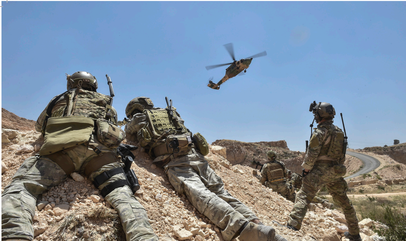
Members of the Jordanian Armed Forces Special Task Force, Air Force Special Tactics Airmen with the 24th Special Operations Wing and Italian special operations forces provide security for an incoming Royal Jordanian Air Force UH-60L Blackhawk helicopter during a combat search and rescue mission at Eager Lion.

Employing different specialties and tools, USSOF takes a holistic approach to threats across the competition continuum.