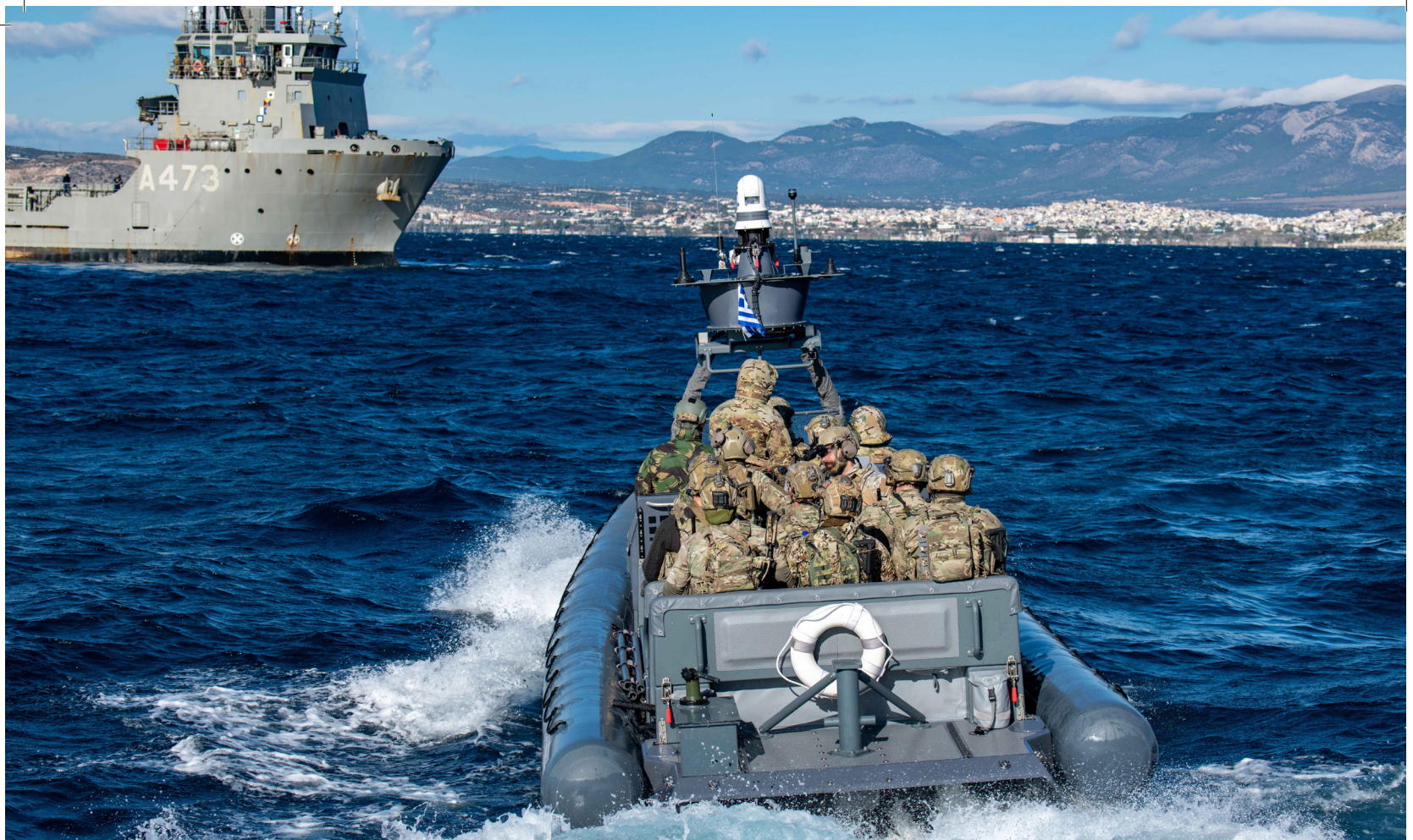
East-coast based U.S. Naval Special Warfare Operators (SEALs) conduct visit, board, search and seizure training with Allied Special Operations Forces near Athens, Greece.

European nations to further develop their reserve force capabilities and whole-of-society resilience, both of which would be crucial to inhibit China from taking over Taiwan or respond to a potential Russian invasion. 66 Policymakers should consider revising legislation such as the foreign security force capacity-building authority in Section 333 to support USSOF's evolving role in strategic competition and stabilization activities. 67