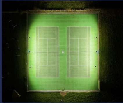
DOUBLE TENNIS COURT - 6 KITS