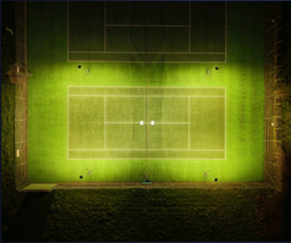
SINGLE TENNIS COURT - 4 KITS