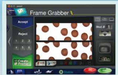
Scan the accepts image with full color camera.