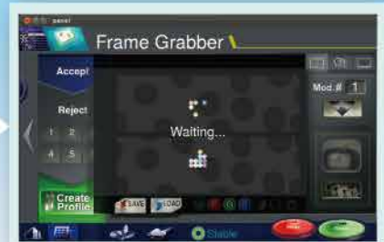
Press the button to create the sensitivity by which the machine distinguishes accepts and rejects.