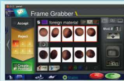
Scan the rejects image.