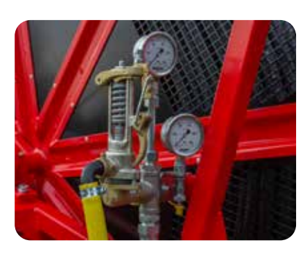
Both pressureguages for water and hydraulics are easy to check.