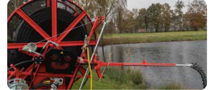
WINCH OPERATION Manual arm operation with a braked winch.