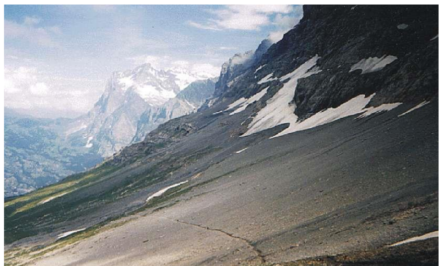
Figure 2 – An ideal location for the new laboratory

Please be aware that coloured diagrams and photographs frequently do not convert sensibly to black and white presentation. Again, it is the author's responsibility to check the presentation of these in the printed version.