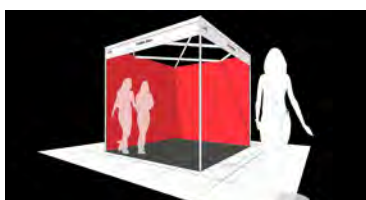
Flush Fitting Graphic