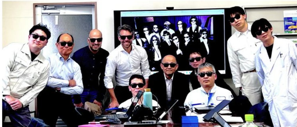
Nitten-NoMy Beet Band feat.1