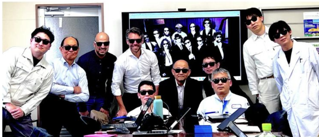
Nitten-NoMy Beet Band feat.1