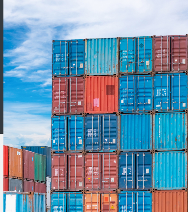
Original series 1 freight container